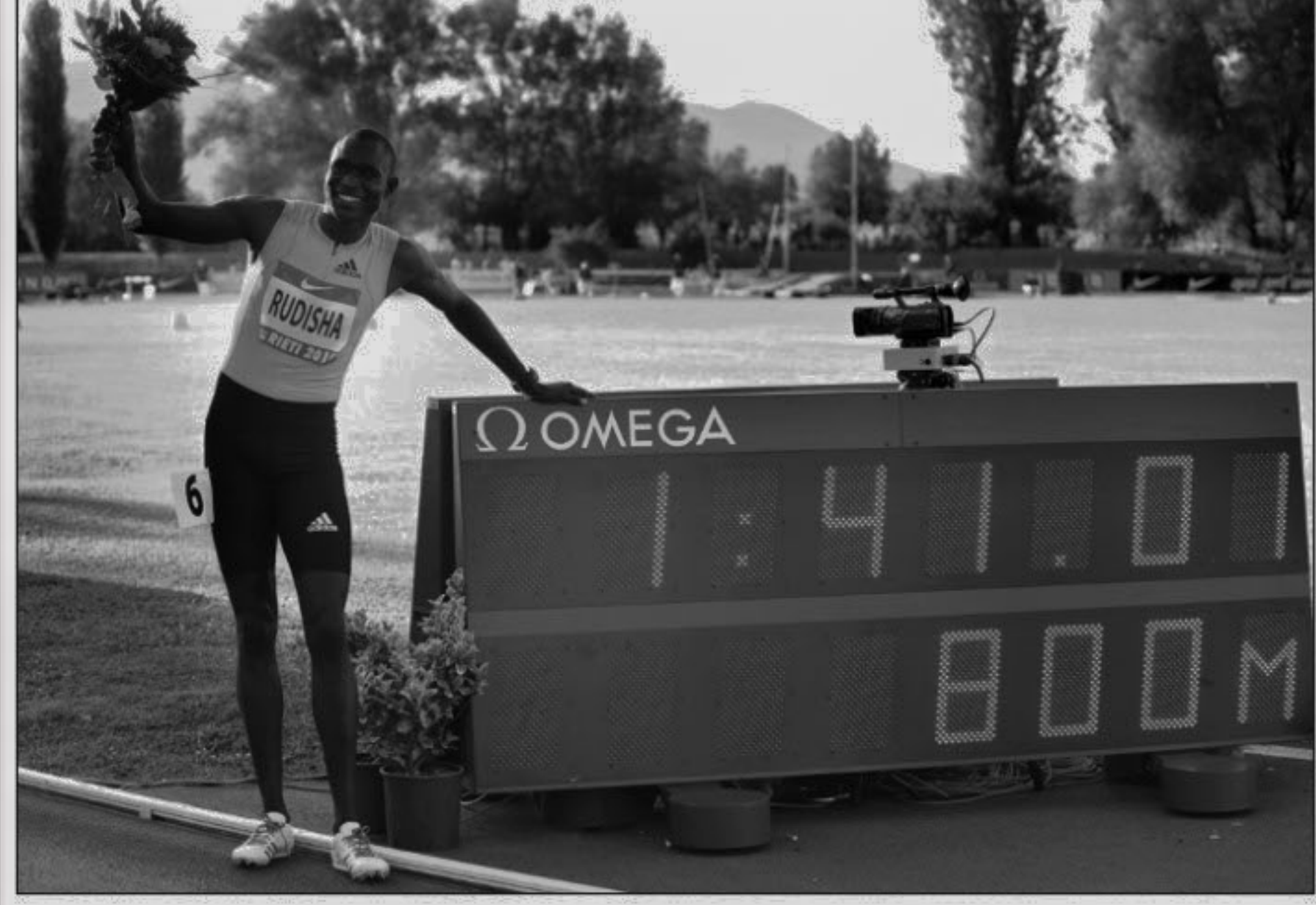
Kenyan runner David Rudisha poses near the timing board that shows his new world record for the 800 metres at the 40th IAAF Grand Prix at Rieti in Italy on Sunday.