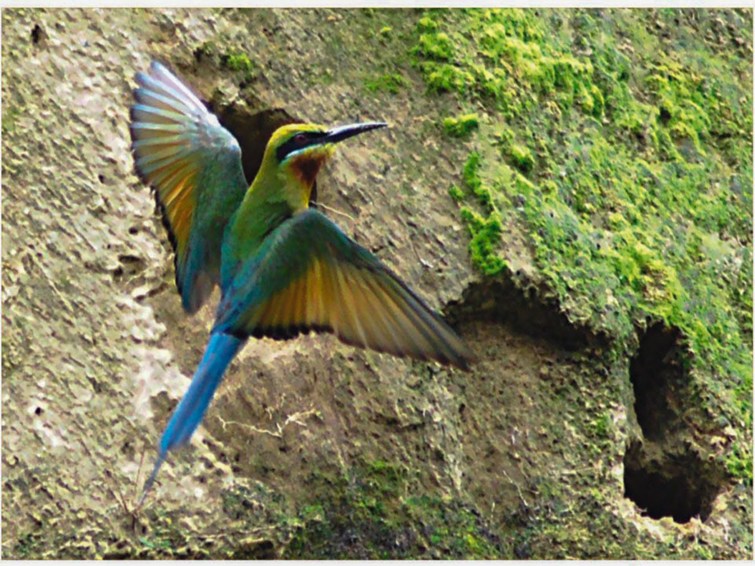
The Bee-eaters on the hilly slopes at Tiger Pass, Chittagong. Bee-eaters predominantly eat flying insects and nest making holes in the hills.