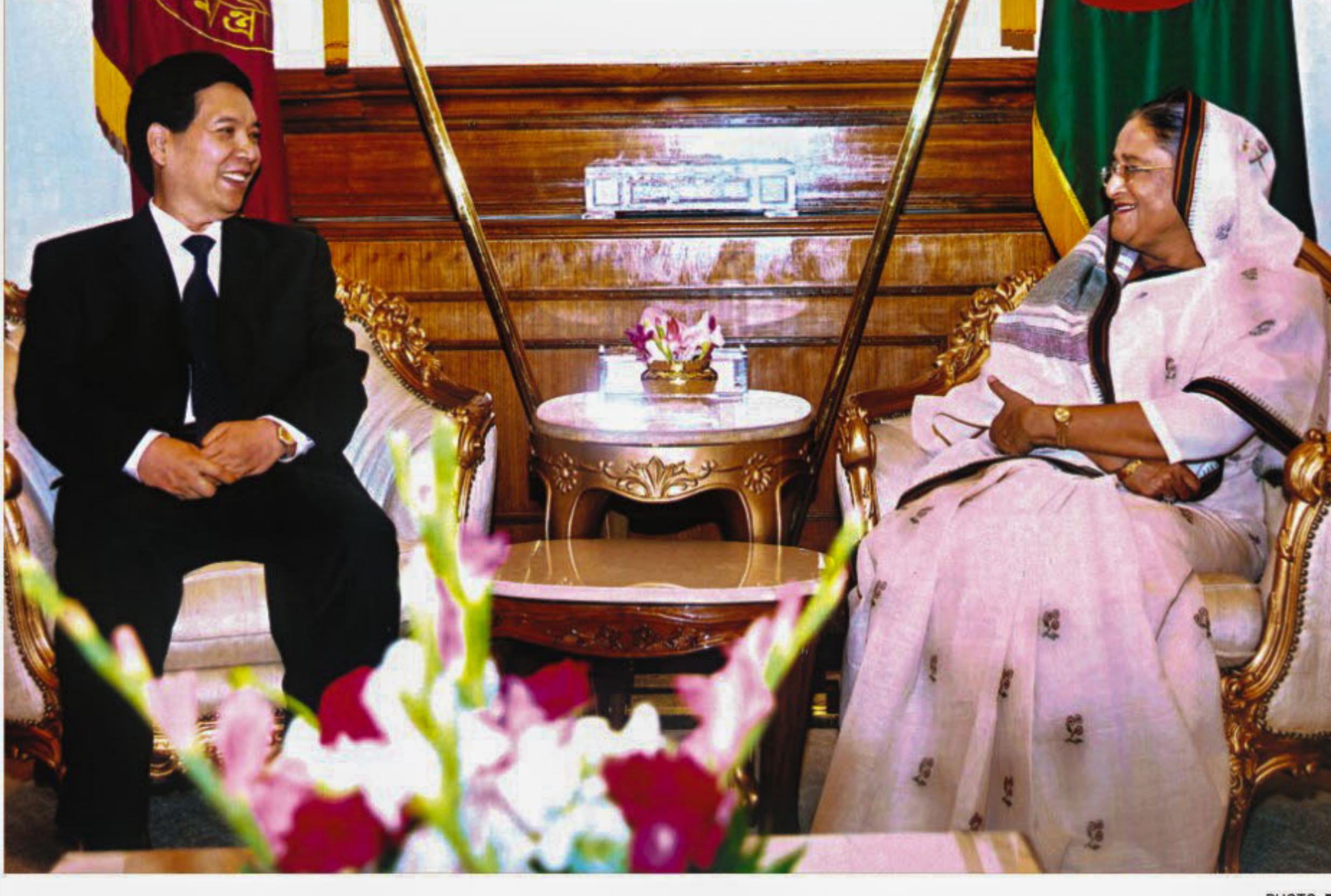
China's Yunnan province Governor Qin Guangrong calls on Prime Minister Sheikh Hasina at the latter's office yesterday.

STAFF CORRESPONDENT The education ministry has decided to formulate a policy guideline to stop corporal punishment in classrooms to ensure a more conducive atmosphere for the students. The decision came at a meeting yesterday following the government's order banning physical punishment in all educational institutions in the country. The policy would carry a detailed outline on behaviour of teachers towards students, the kind of punishment permissible, motivational tools for both teachers and students, and the role of parents and management authorities, said the ministry sources. Education Minister Nurul Islam Nahid chaired the meeting. The meeting discussed outlines of the policy, which would be improved at an inter-ministerial meeting held SEE PAGE 15 COL 2