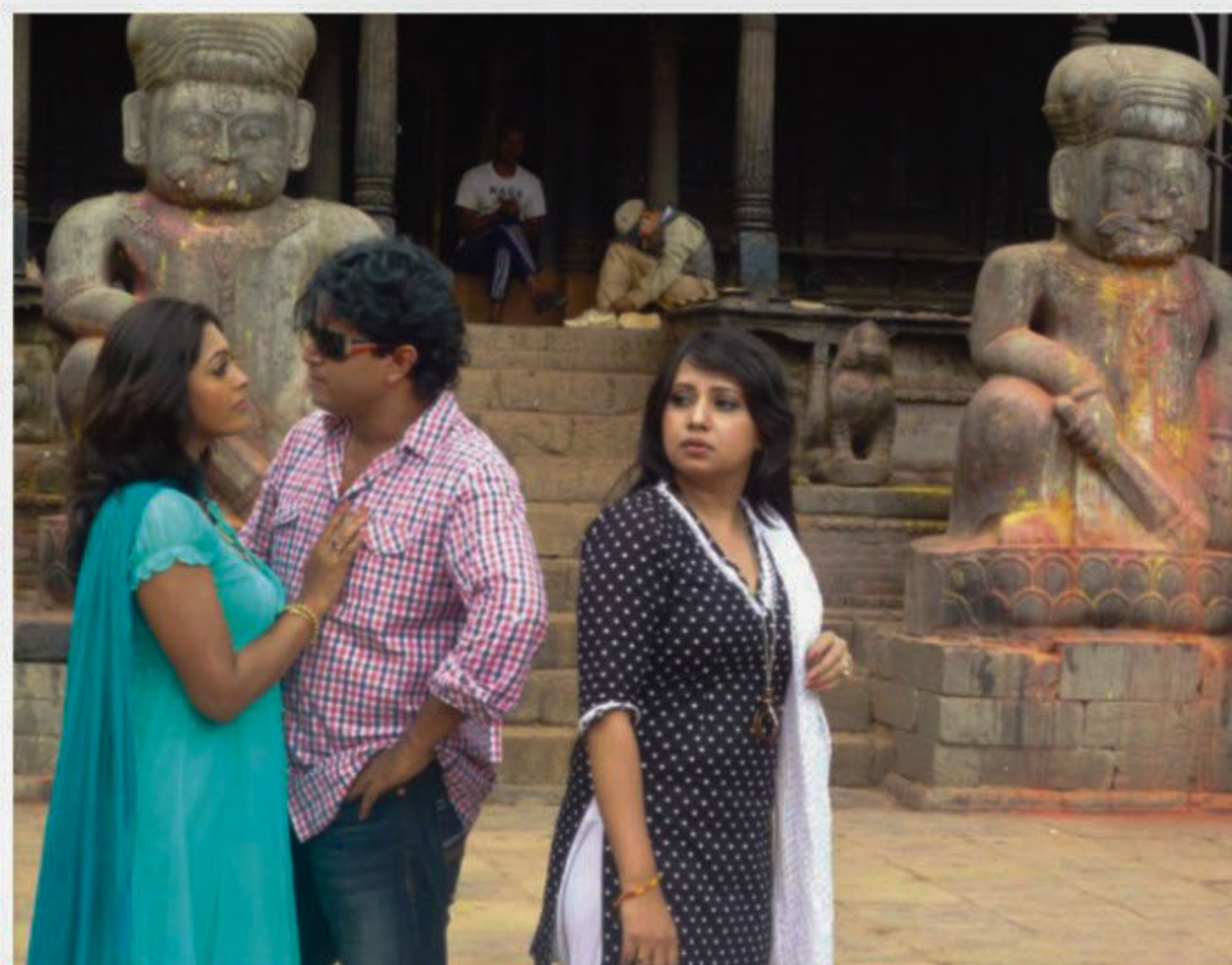
A scene from the film.

The cast includes Mahfuz Ahmed, Mahbuba Islam Sumi and Nipun.