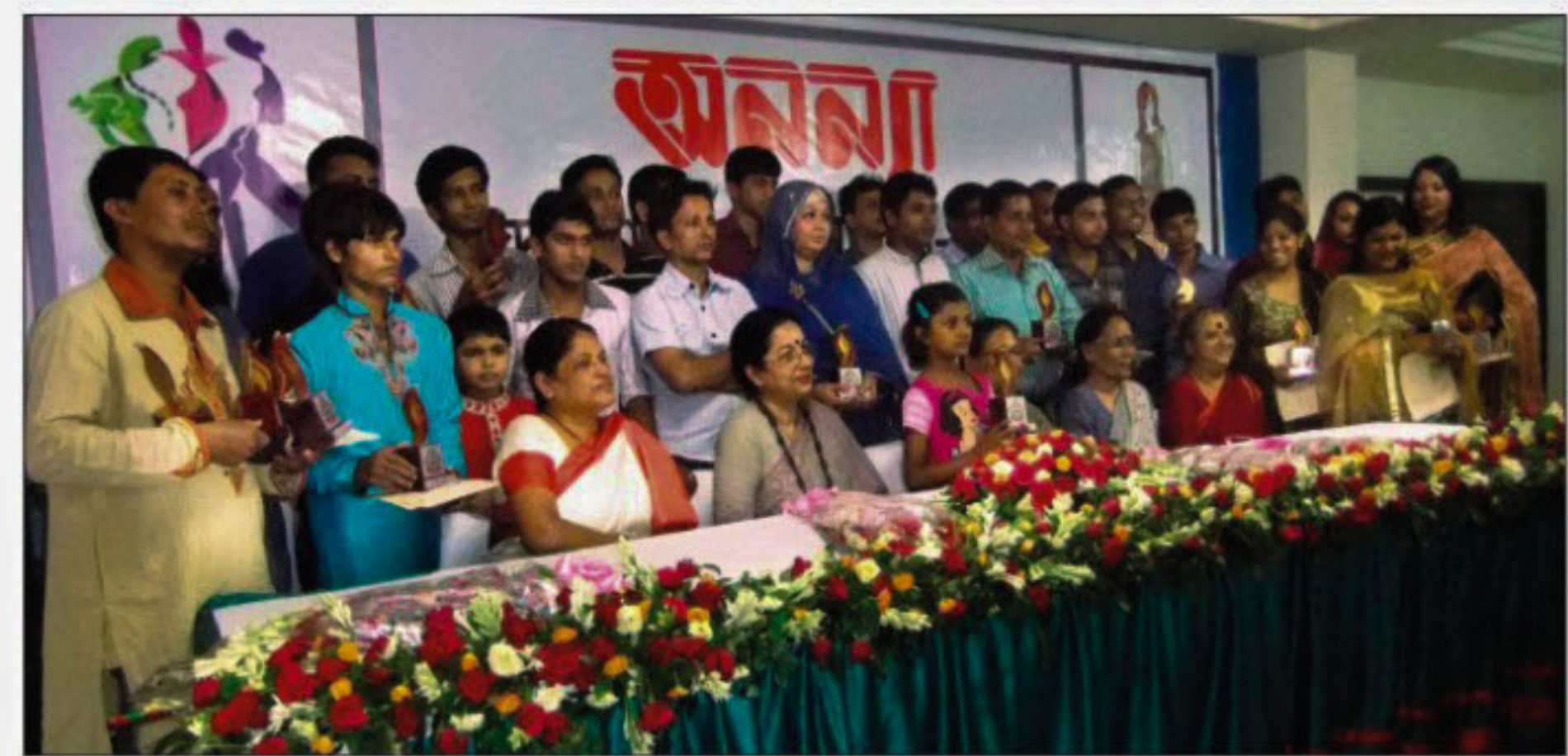
Winners (back row) of the contest with honourable guests.