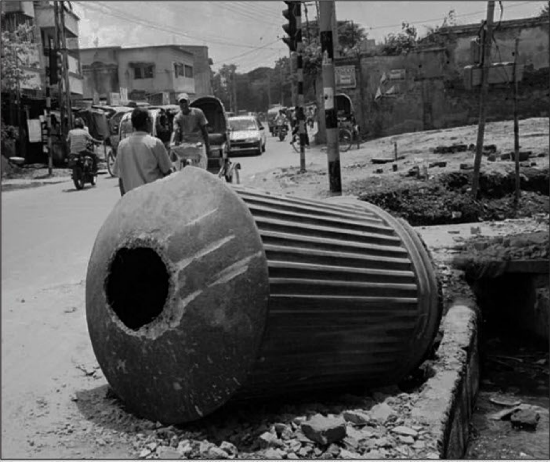
DEVELOPMENT AT THE COST OF TRADITION: A 73-year-old water supply tank, locally known as Rani Hemanta Kumari Dhopkal, lies mangled at Sagarpara in Rajshahi city as authorities allowed demolition of the traditional water supply points for development work.