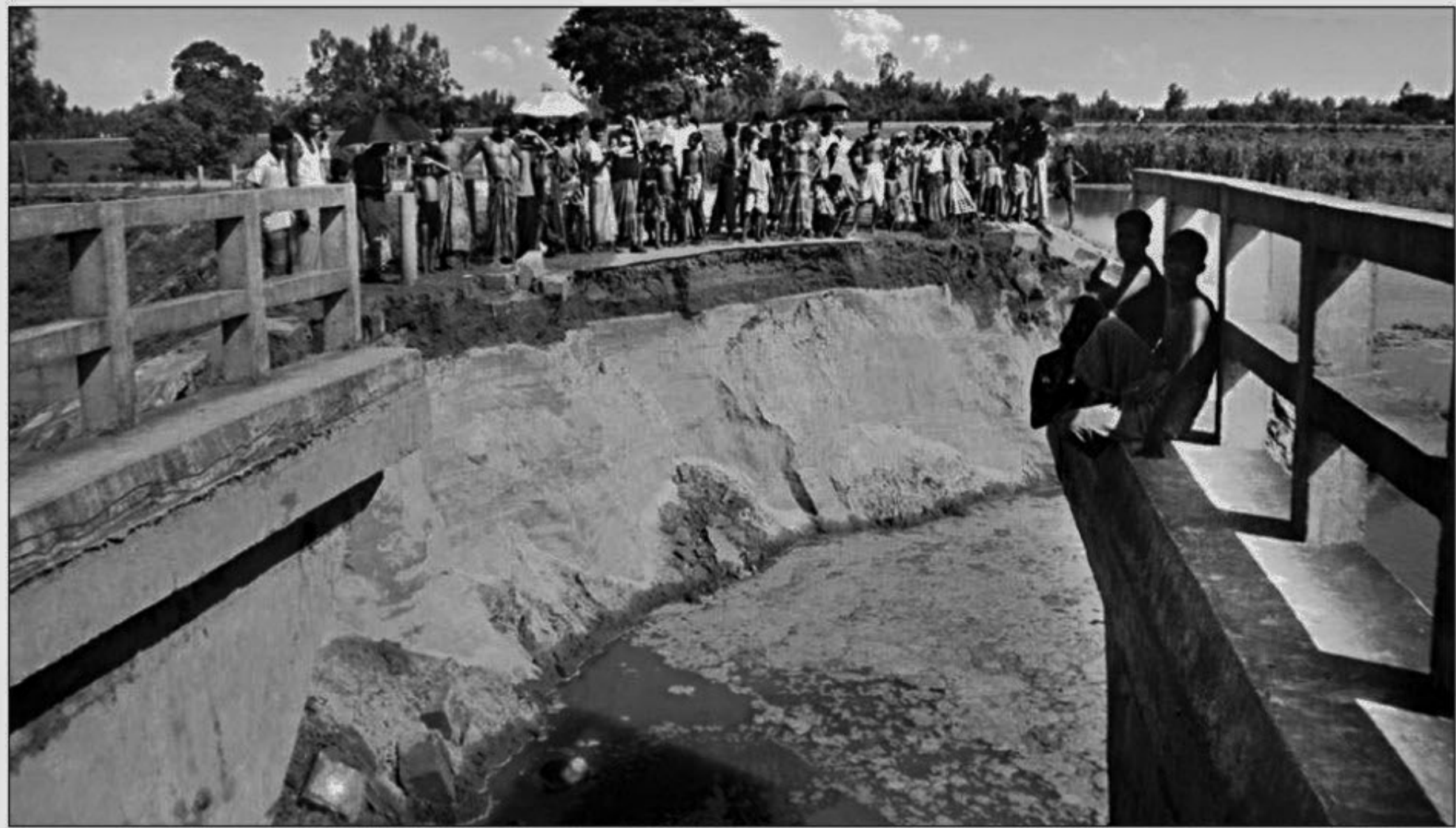
Bangali River devoured the approach road of Dewantola bridge at Mohimaganj on Sunday night, disconnecting road communication between Gobindaganj and Shaghata upazilas of Gaibandha district.

Beside, erosion by the river Jamuna has taken a serious turn at Tarapur, Belka, Haripur, Kapasia and Sreepur under Sunderganj upazila, Mollar Char, Gideri and Kamarjani under Gaibandha Sadar upazila, Kanchipara, Fazlupur, Erendabari and Uria under Fulchari Upazila, and Bharatkali, Haldia and Ghuridaha in Shaghata upazila.