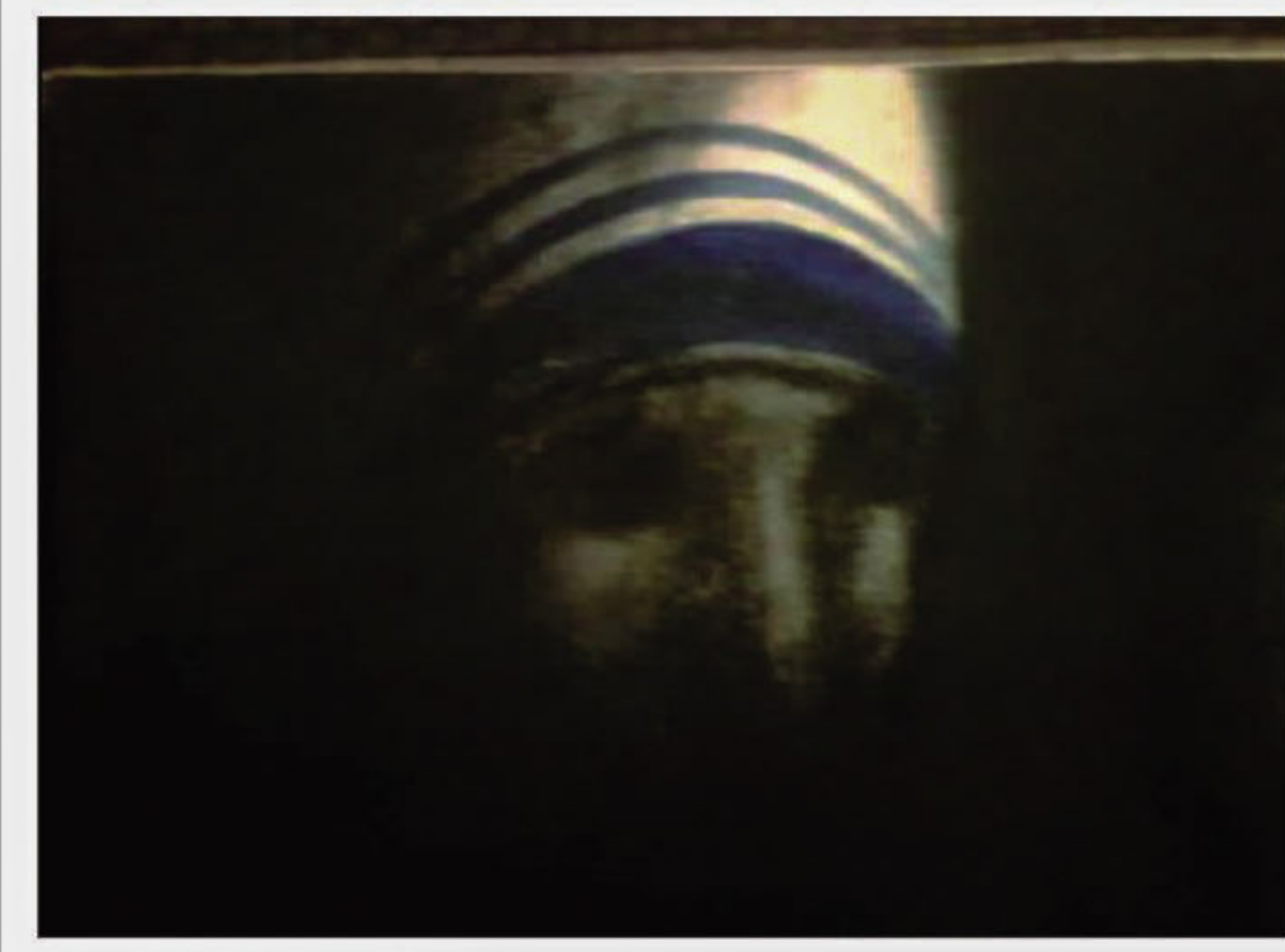
The painting by Salman Khan.