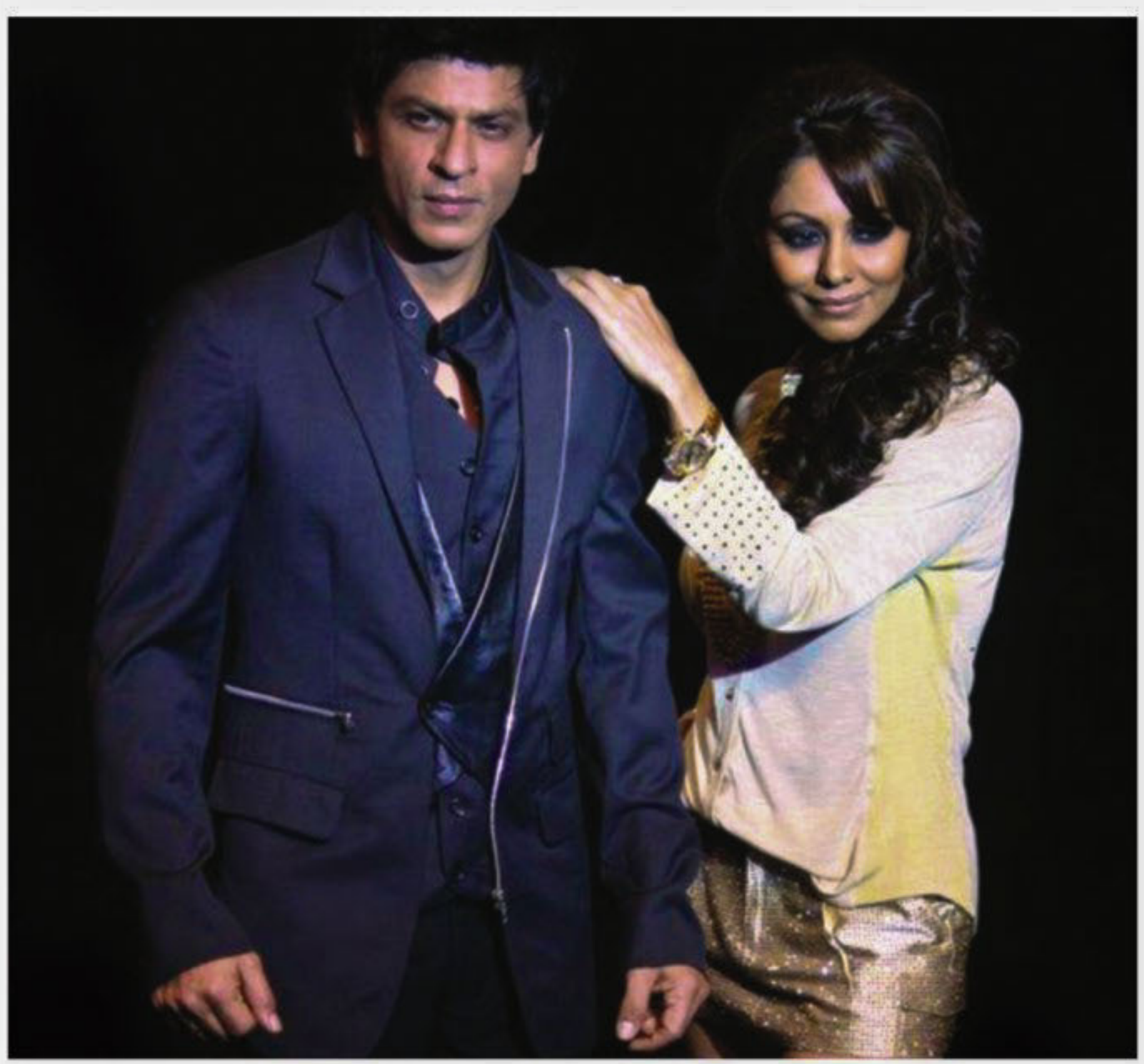
Shahrukh Khan with his wife Gauri.