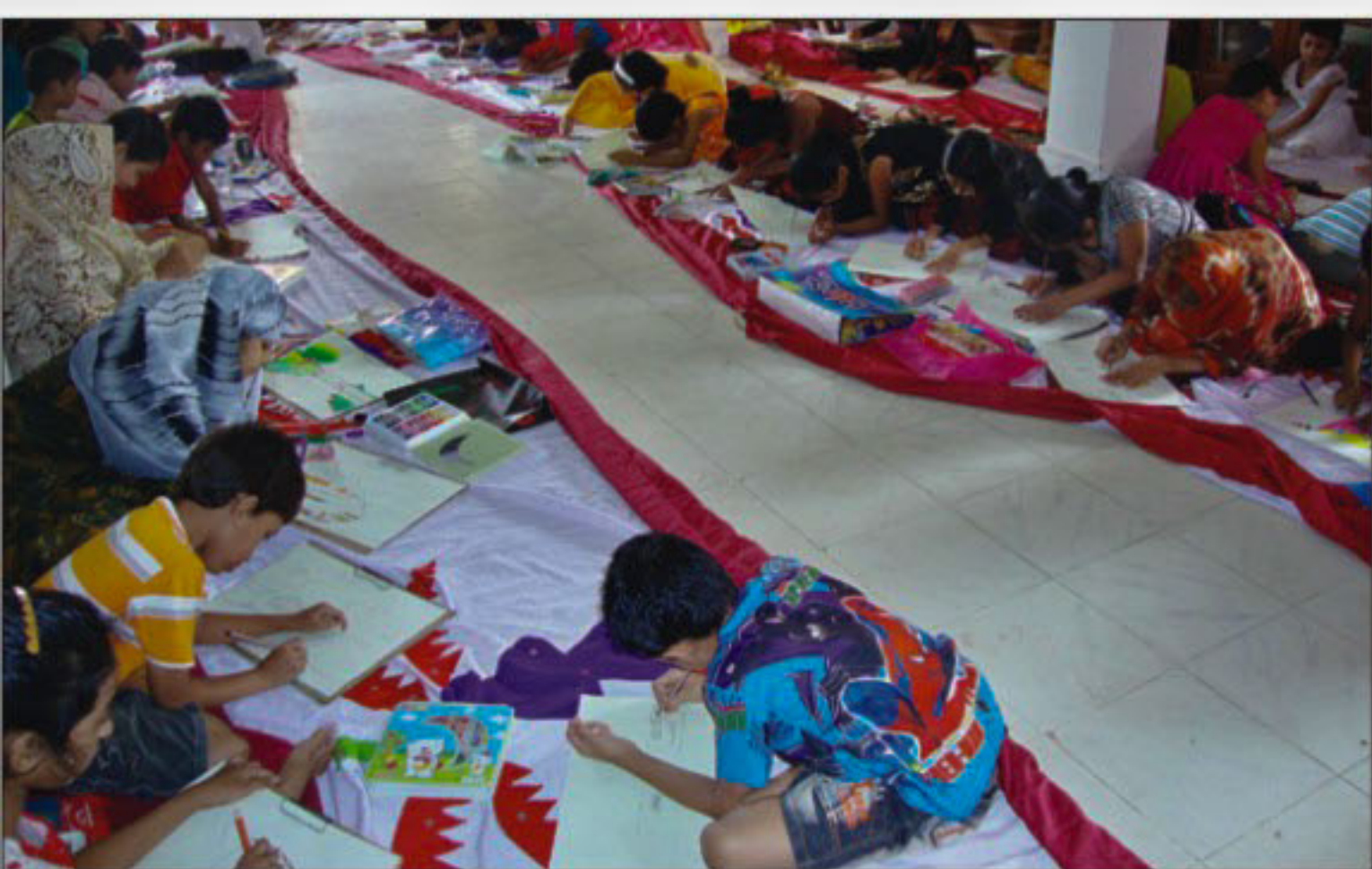
Children taking part in the competition.