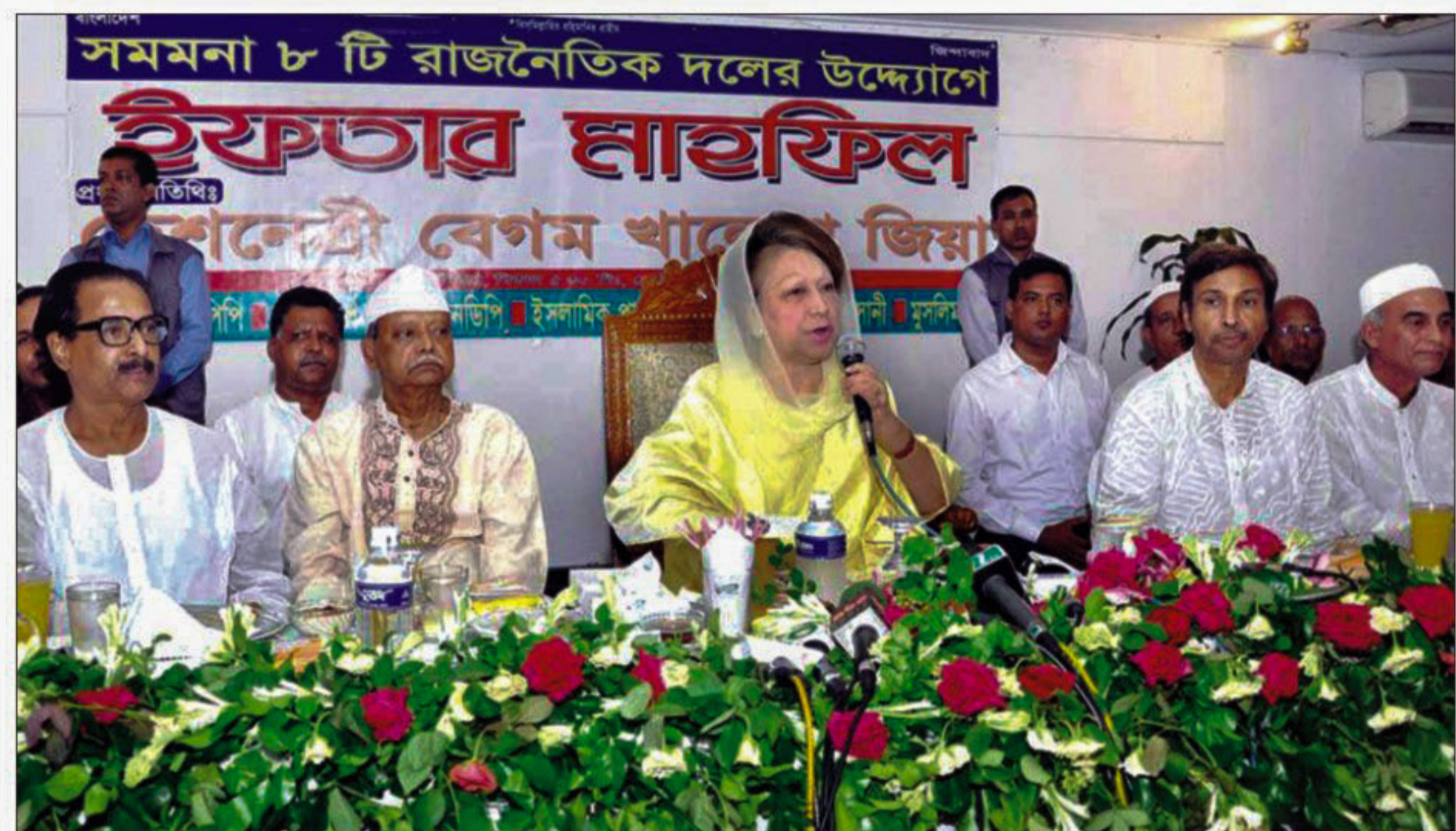
Leader of the Opposition in Parliament and BNP Chairperson Khaleda Zia speaks as a chief guest at Hotel Purbani in the city in an Iftar party.