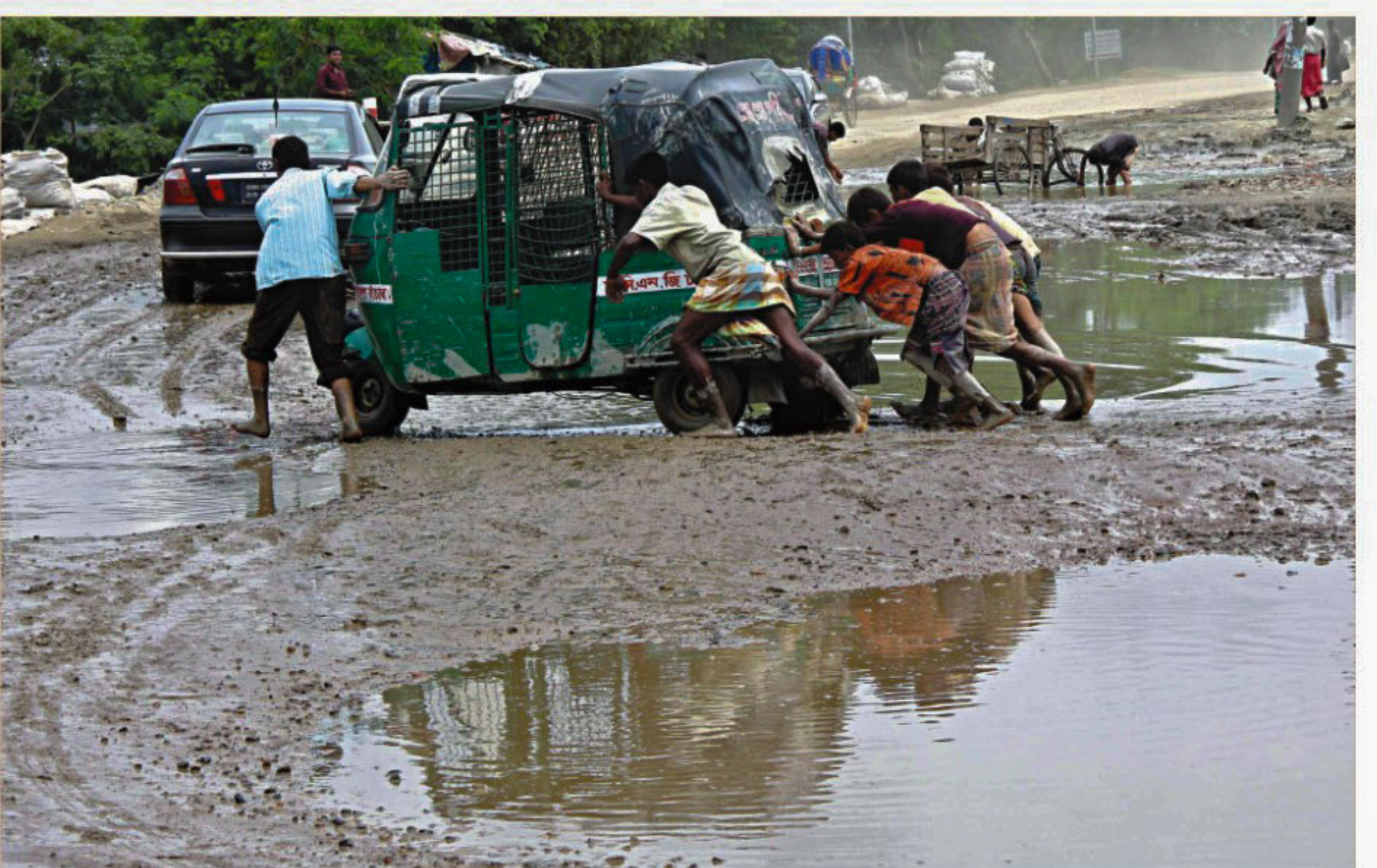
People struggle to rescue a three wheeler stuck on a muddy road near Gabtali Dip Bazar yesterday. Commuters using the dilapidated road suffer a too troublesome journey every day, especially when it rains.

as the core of the parliamentary system of government. And accordingly, it was allowed sweeping authority to effectively hold the executive branch accountable. Some reasonable restrictions were however imposed on members of the parliament, to prevent floor crossing, for the stability of the government. The legislature was also empowered to remove constitutional officers such as the judges of Supreme Court, the chief election commissioner, election commissioners, the