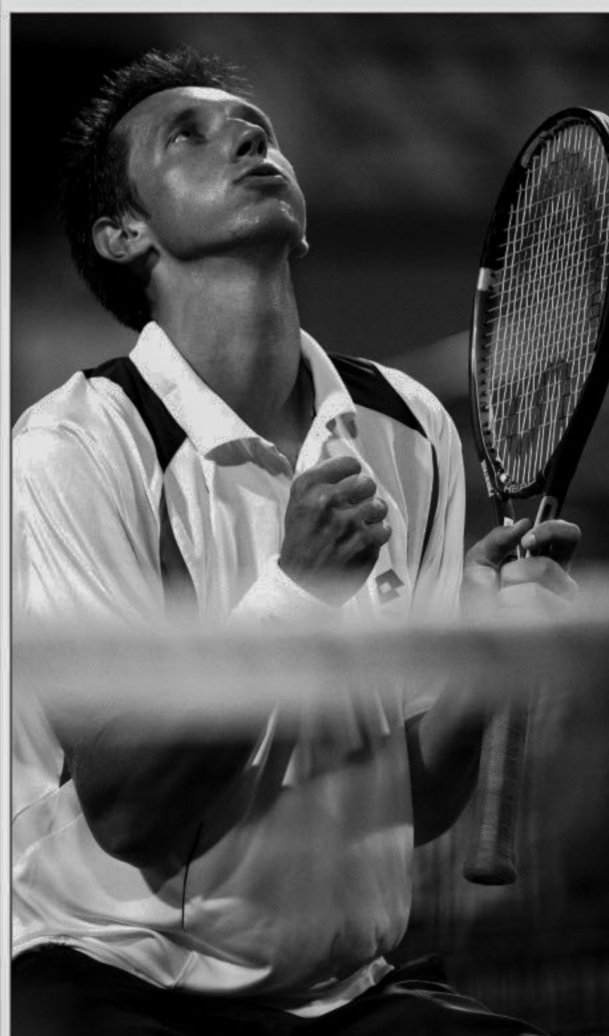
Sergiy Stakhovsky of the Ukraine reacts to a point against Marcos Baghdatis of Cyprus in the Pilot Pen quarterfinals at the Connecticut Tennis Centre on Thursday.

advancing to Friday's semifinals. "I had to make a lot of sprints, you know," Baghdatis said. "I felt my legs a bit tired after. I couldn't be 100 per cent." Stakhovsky was a bit tired too. He had his first-round match on Tuesday suspended by darkness and finished that Wednesday, beating Peter Luzak 6-3, 7-6 (4). He started his third-round match Wednesday night against Spaniard Tommy Robredo, before that was suspended by