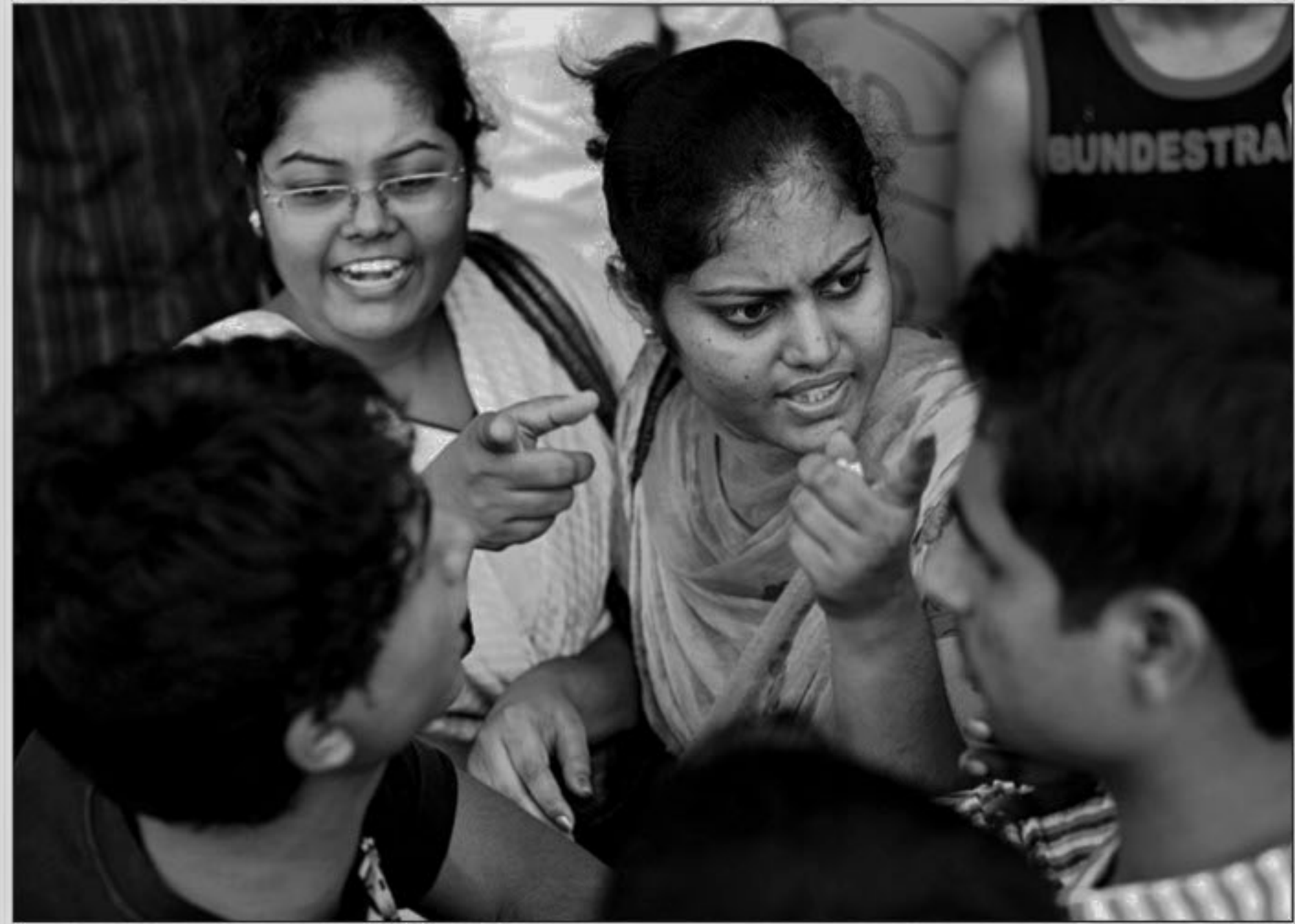
These two young women voice out their protests, as they became victims of striking by youths when they came to New Market in the city yesterday for shopping.