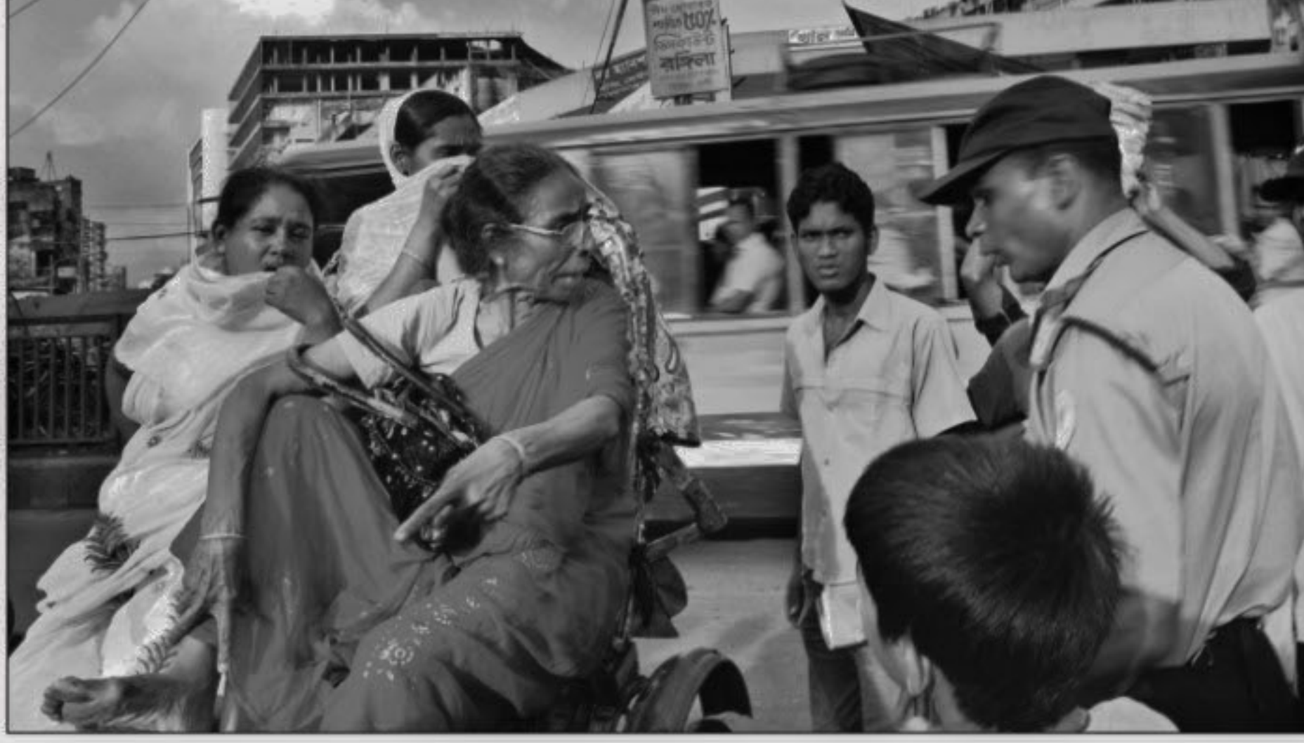
This agitating woman, claiming to be a local leader of Awami League, quarrels with a policeman in front of the New Market in the city yesterday when the law enforcer stopped their rickshaw from going against traffic.