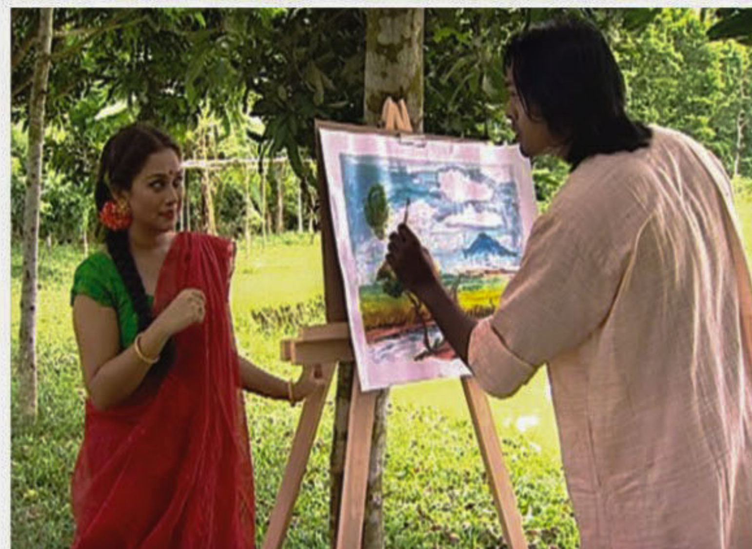
A scene from the TV play "Shilpi".