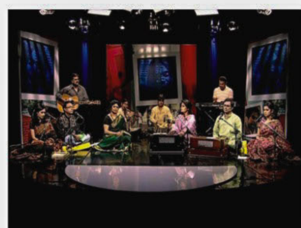
"Bidrohi Bulbul" will feature renditions and recitations.