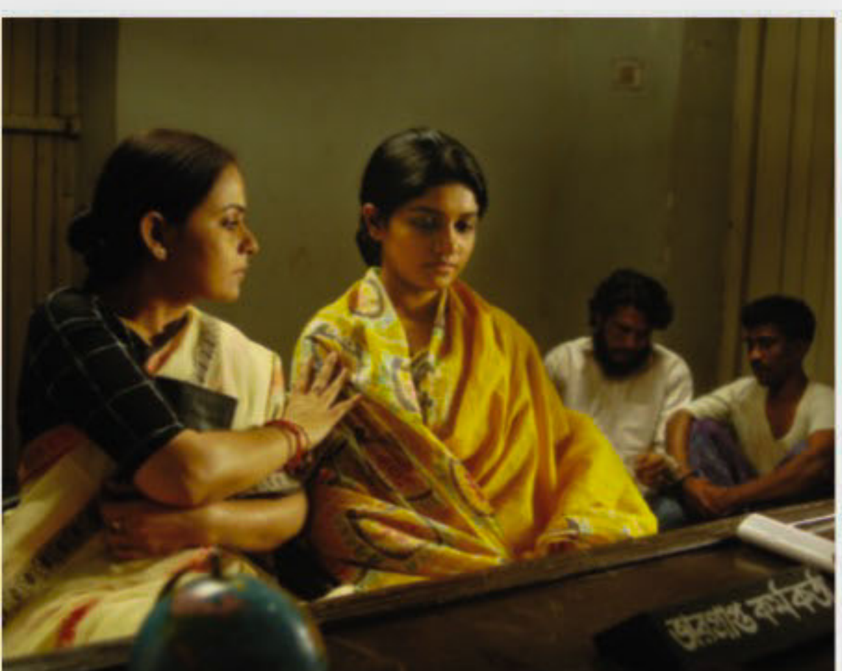
A scene from the film "Priyotomeshu".

He said a number of directors, including Morshedul Islam, and actors from cinema worlds of South Asia are expected to attend the coming South Asian Festival and their list as also the full bouquet of films are being finalised.