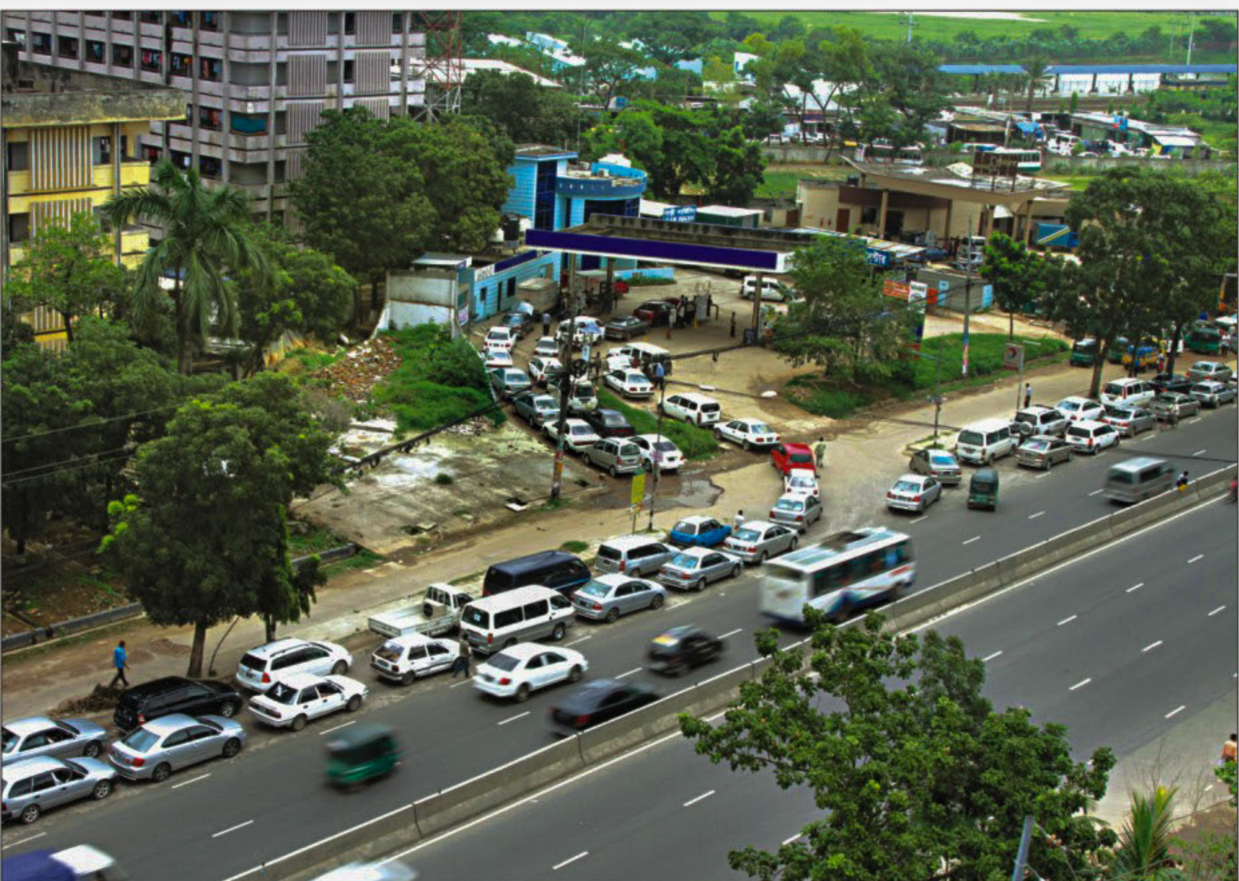
Vehicles waiting in a long line to refuel at a filling station on Kuril Bishwa Road at Uttara in the city around 12:00noon on Wednesday as the government has ordered to keep the filling stations closed from 3:00pm to 9:00pm every day.