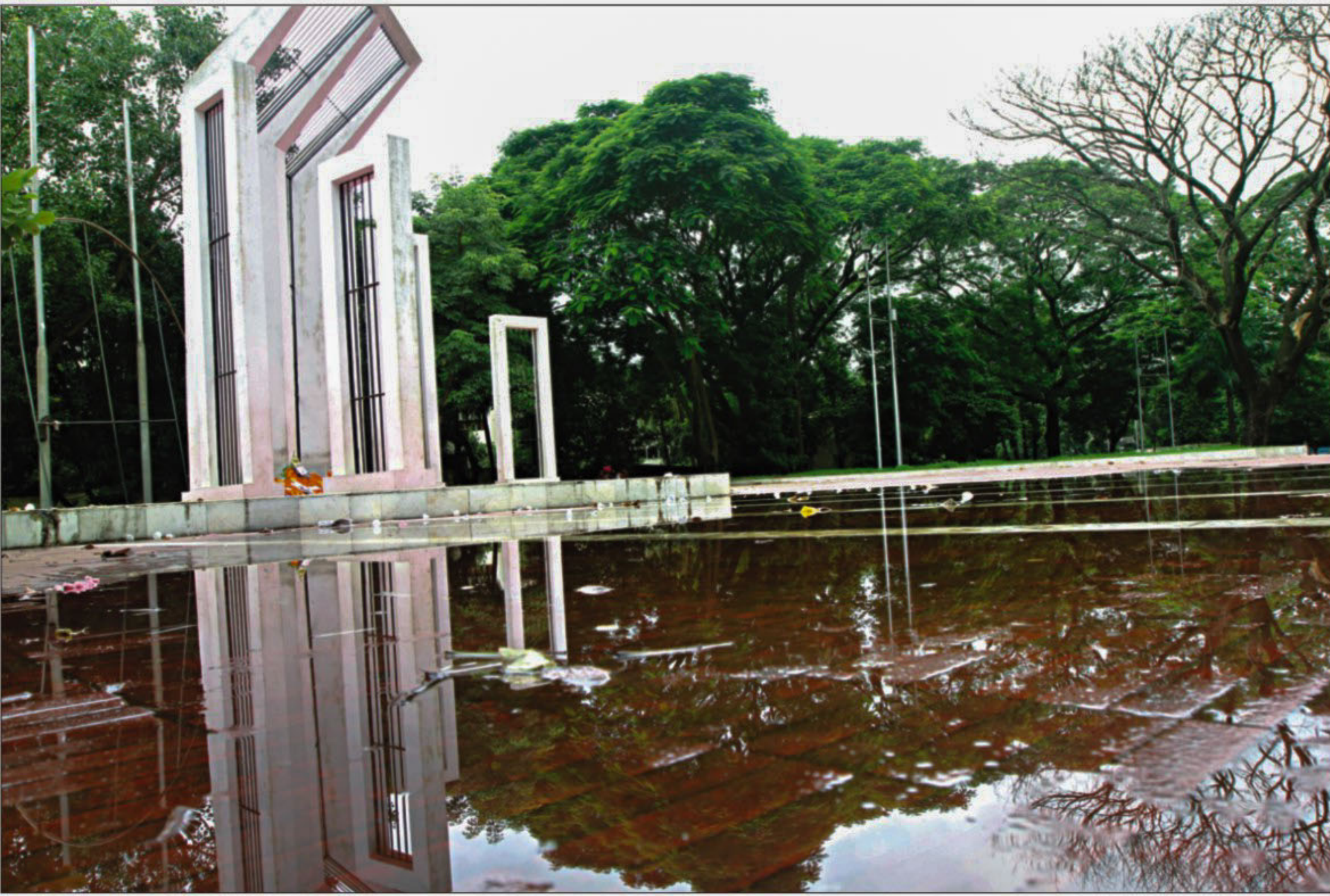
Absence of drainage facilities leaves water stagnant at the base of the Central Shaheed Minar in the city after Wednesday's rain. As per the Wednesday's High Court directives, the sanctity and honour of Shaheed Minar must be protected. The photo was taken yesterday.