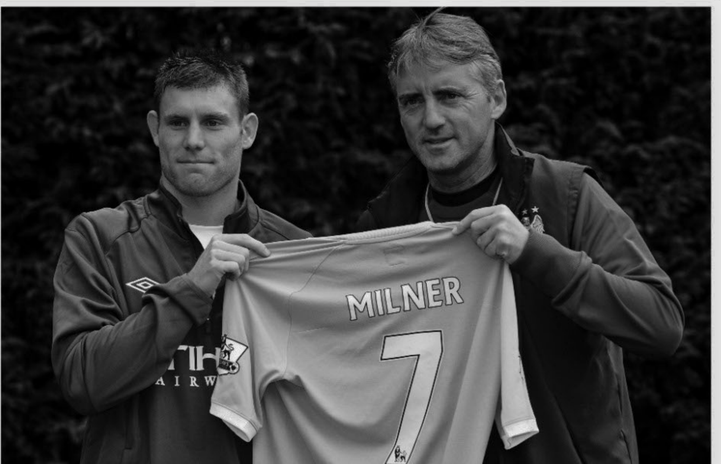
Manchester City's new signing English midfielder James Milner (L) and manager Roberto Mancini pose during a photocall at their training ground in Manchester yesterday.