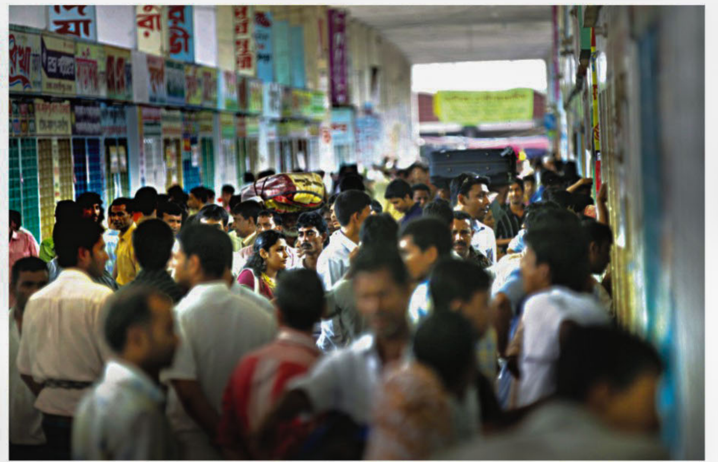
City dwellers crowding at the counters in Gabtoli bus terminal to buy advance tickets for home during the Eid vacation.