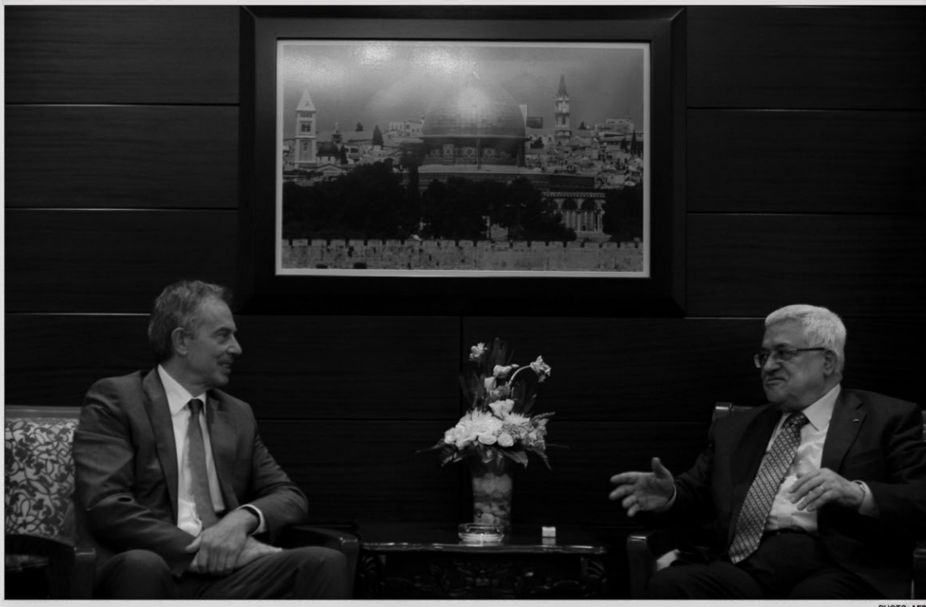
Palestinian president Mahmud Abbas (R) meets with Quartet Middle East envoy Tony Blair in the West Bank city of Ramallah yesterday.

Prime Minister Benjamin Netanyahu has not said what he will do. If he resumes construction, the Palestinians say they will walk away from peace talks slated to start next week.