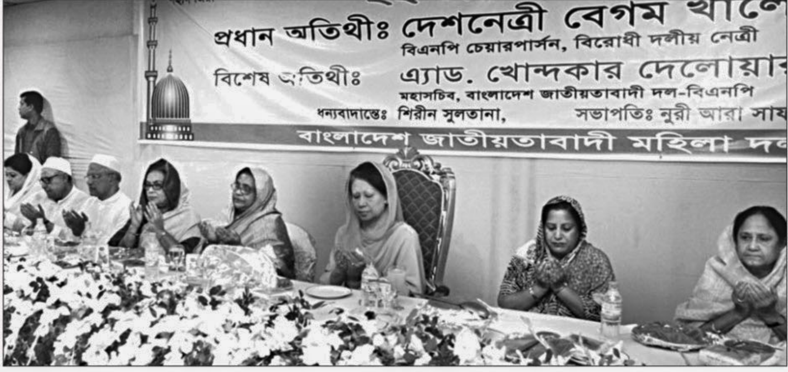
Leader of the Opposition in Parliament and BNP Chairperson Khaleda Zia attends an iftar party organised by Bangladesh Jatiyatabadi Mahila Dal at a city community centre yesterday.

He will be buried at family graveyard after third namaz-e-janaza at GM Hat Haji Monir Ahamad College ground on the same day at 3:30pm. All are requested to pray for salvation of the departed soul.