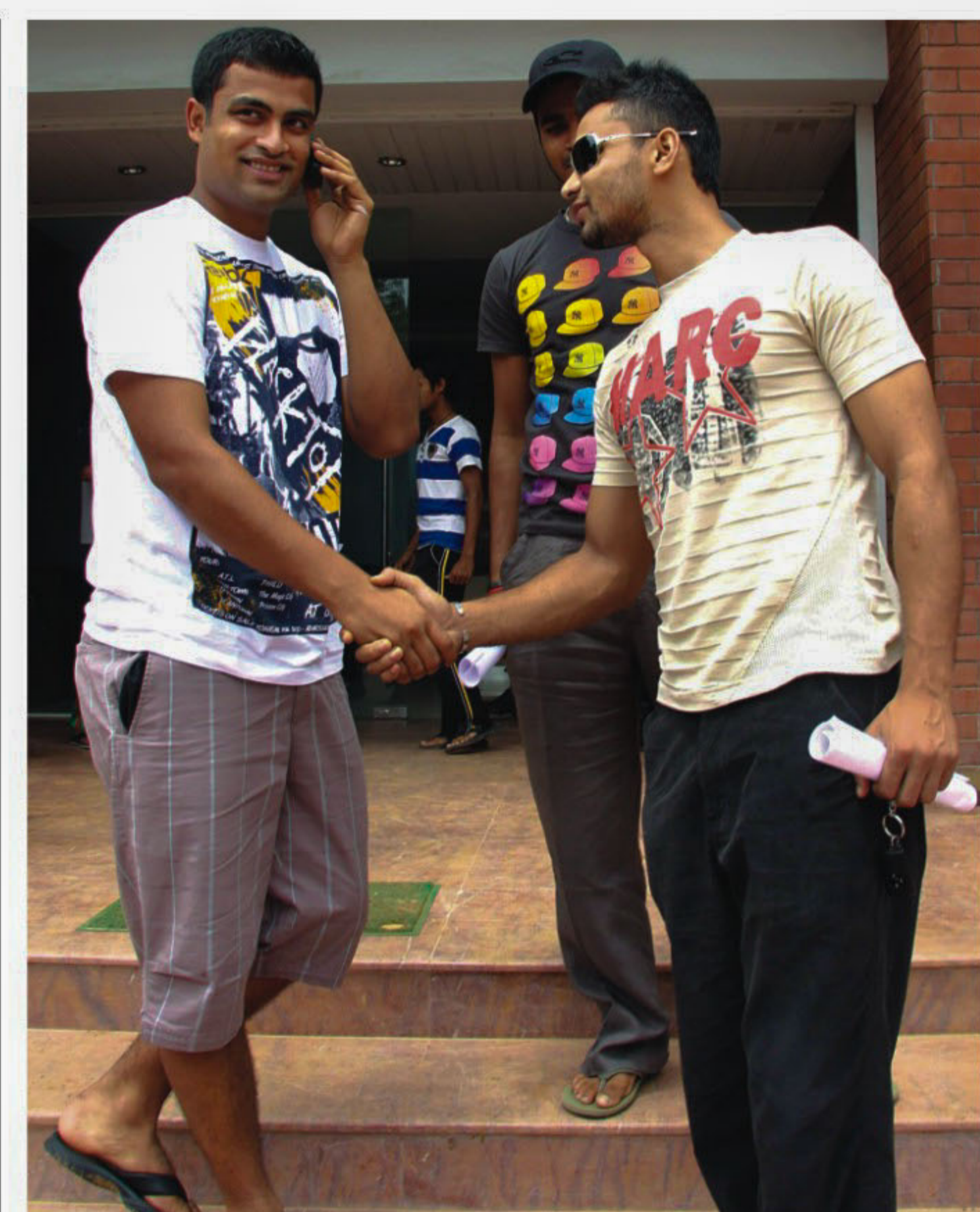
Bangladesh captain Mashrafe Bin Mortaza (R) greets teammate Tamim Iqbal outside the Sher-e-Bangla National Stadium in Mirpur yesterday after their meeting with coach Jamie Siddons.

"It's still going to be very tough for everyone."