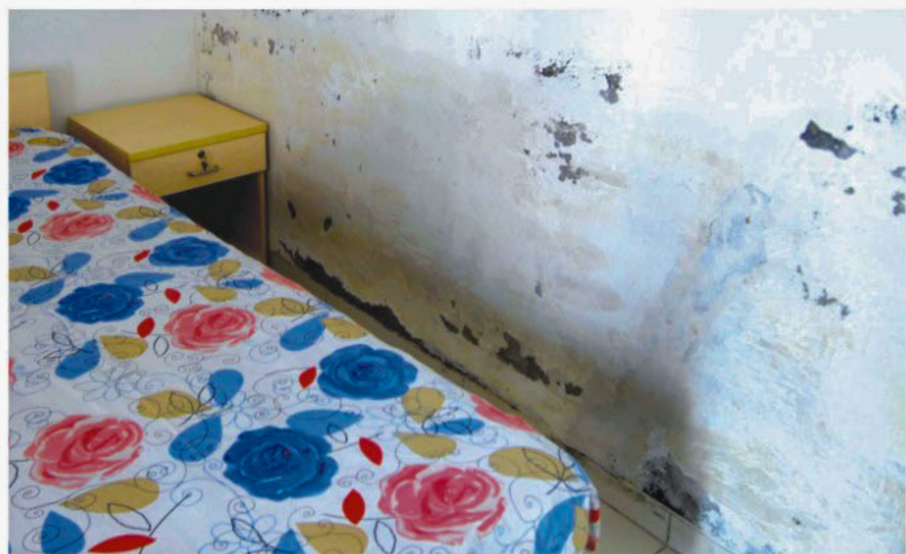
A STYLISH BOOK COVER WITH WET PAGES: A damp develops on the wall in one of the players' rooms at the dormitory of the plush, only from the outside, GP-BCB National Cricket Academy in Mirpur.