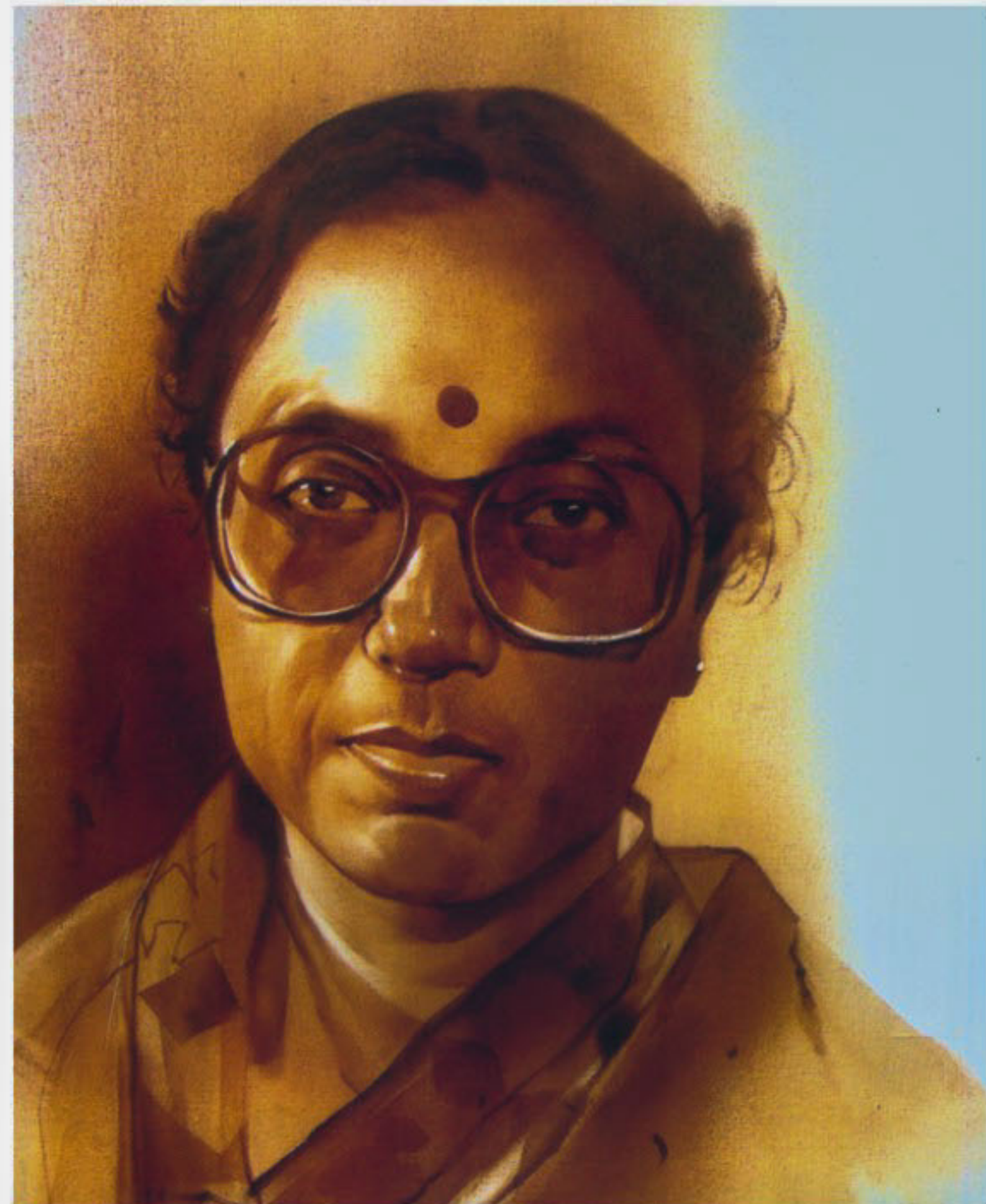
The cover jacket of the book.

The book "Kanthashilpi Nilufar Yasmin" consists of a number of articles and write-ups contributed by the