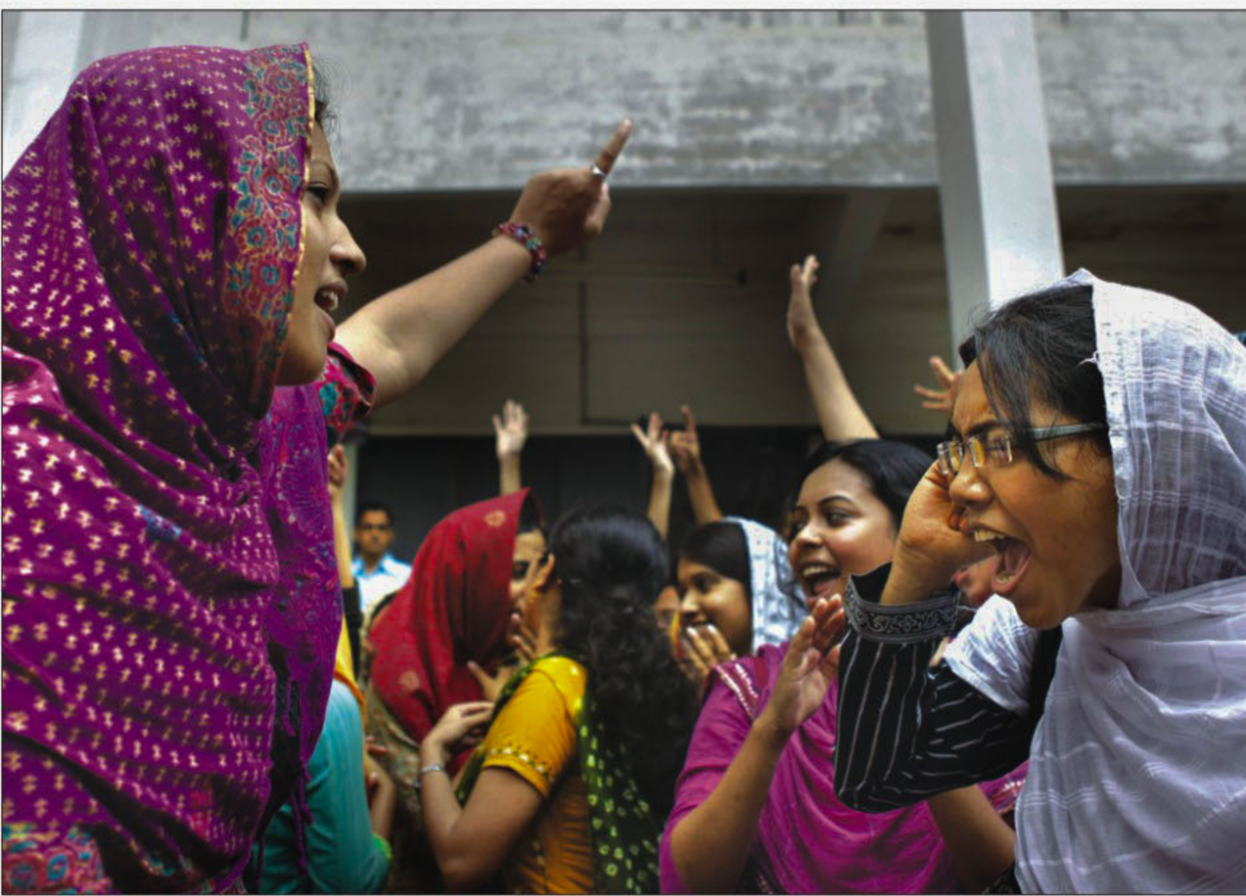
Students of the 11th batch of the business studies of Dhaka University stage a demonstration in front of the dean office on the campus yesterday demanding a new grading system formulated by the University Grants Commission. (Story on Page 5)