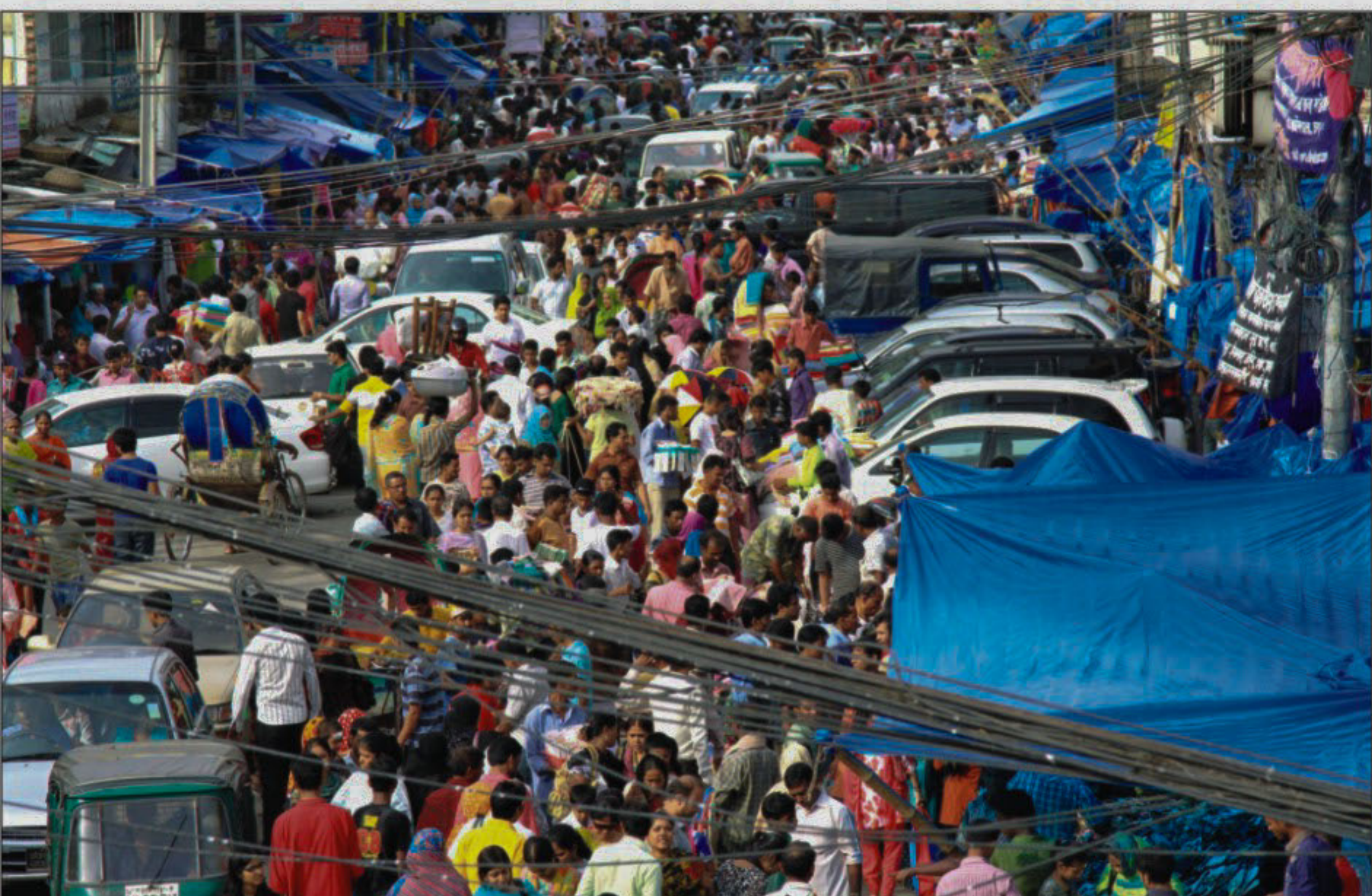
It is time of frenzied shopping ahead of Eid al-Fitr as areas around New Market and Gausia in the city are full of shoppers yesterday.