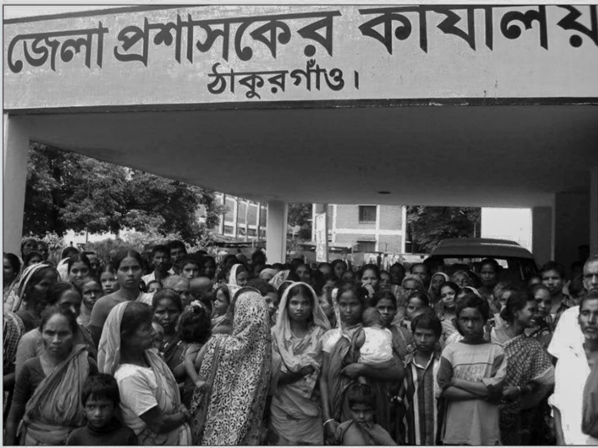
Flood affected indigenous people of Gobindanagar village under Thakurgaon Sadar upazila besiege the deputy commissioner's office demanding relief yesterday.

Members of Bangladesh Rifles (BDR) in a drive seized huge contraband drugs from two highway buses in Fulbari upazila on Wednesday morning. Lt Col Akramuzzaman, commander of Fulbari 40 Rifle Battalion, said being tipped off they raided two buses on the highway at about 10am and seized 2,450 ampoules of Indian pethidine injection, 1000 pieces of sleeping pills and 350 bottles of phensidyl syrup. The BDR jawans held the drivers, supervisors, and helpers of the two buses but later they set them free after a written legal agreement on request of the passengers. Another report from Comilla adds: BDR jawans recovered huge Indian saris and three-piece dress materials from a truck at Kalirbazar in Chouddagram upazila on Wednesday. A team of 33 Rifles Battalion seized the truck in an abandoned condition and recovered 1,376 pieces of expensive Indian saris worth about Tk 92 lakh and 260 pieces three-piece dress materials worth about Tk 9.10 lakh early in the morning.