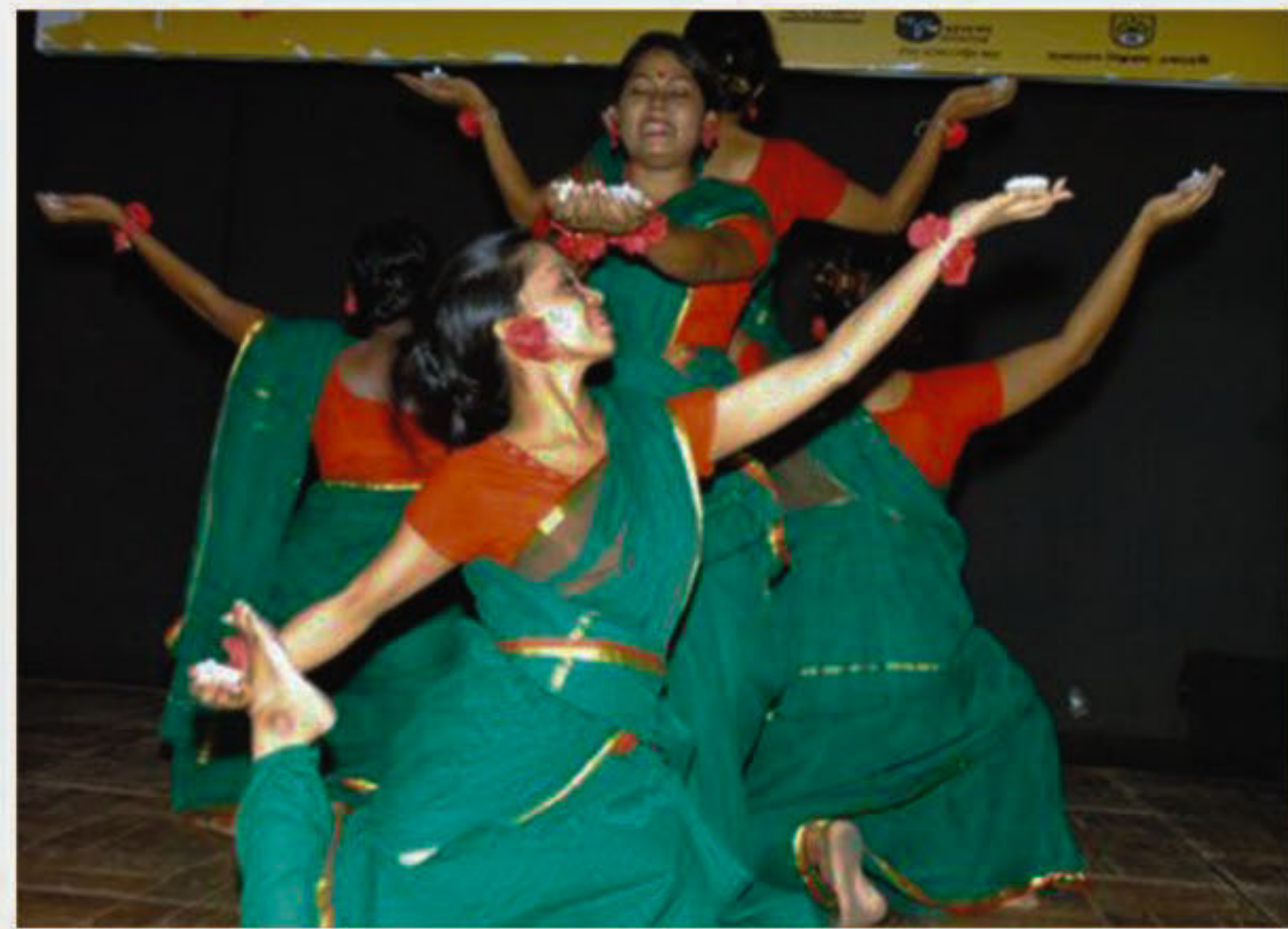
Dancers perform at the opening programme.

tists have shown interest in Bangladeshi plays and indigenous performing art