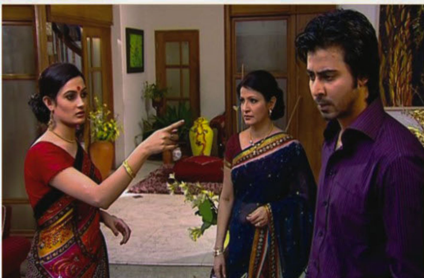
A scene from the serial.