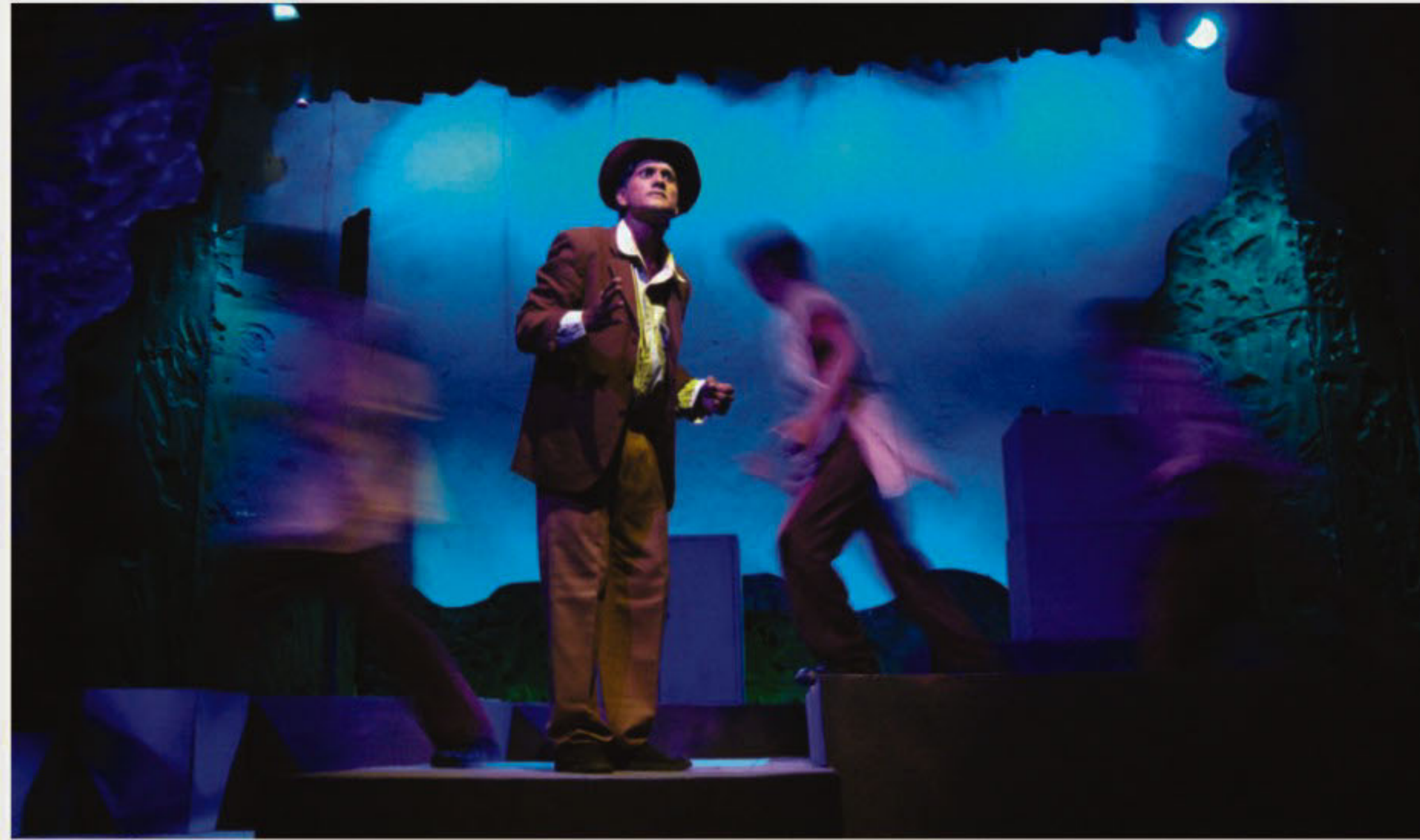
A scene from the play.

Marquez's "No One Writes to the Colonel" staged on the last day