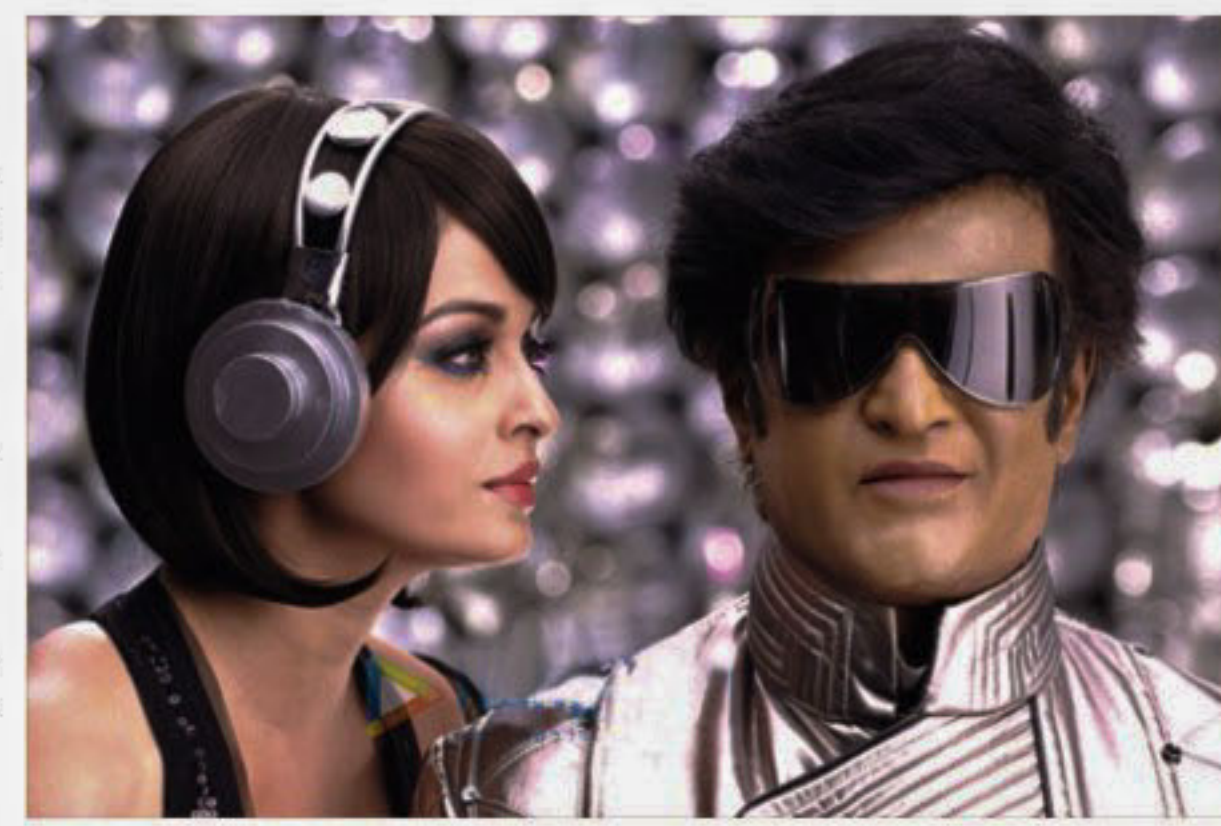
Rajinikanth (right) with Aishwarya Rai Bachchan in "Robot".

At the function, where Rajinikanth and Bachchan shared the dais after three years, the two megastars showered rich compliments on each other.