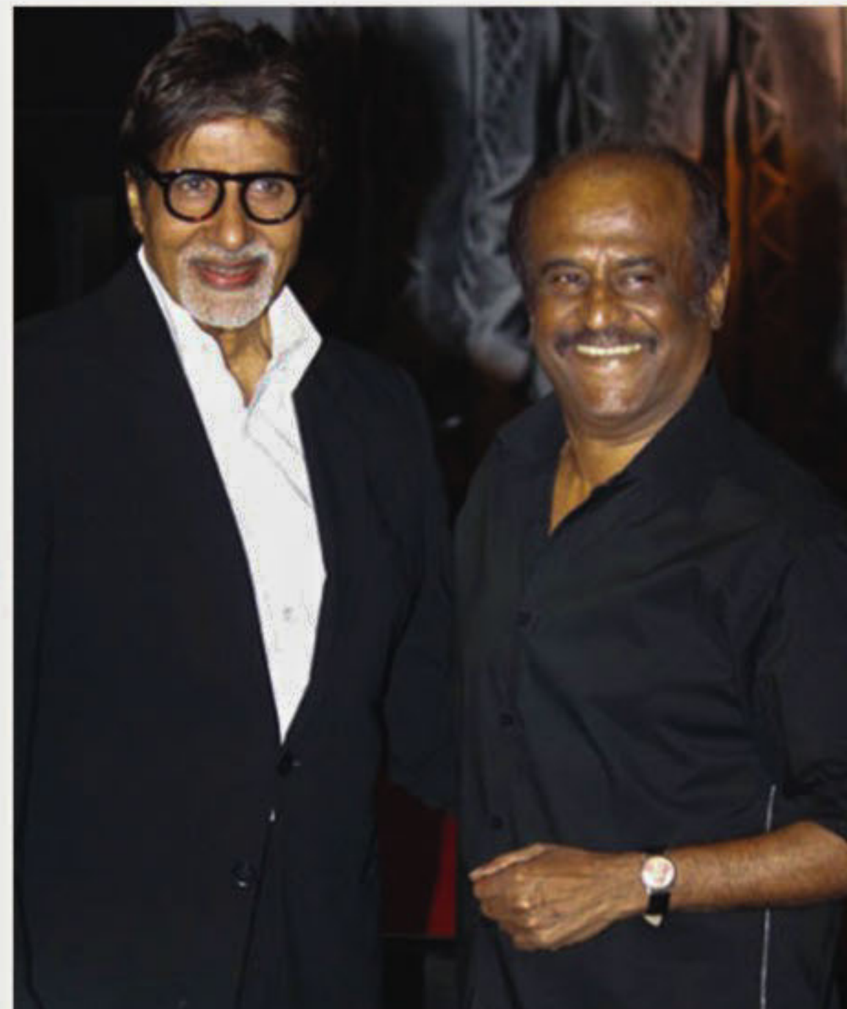
Amitabh Bachchan (left) and Rajinikanth.

"Robot" is slated for a September release.