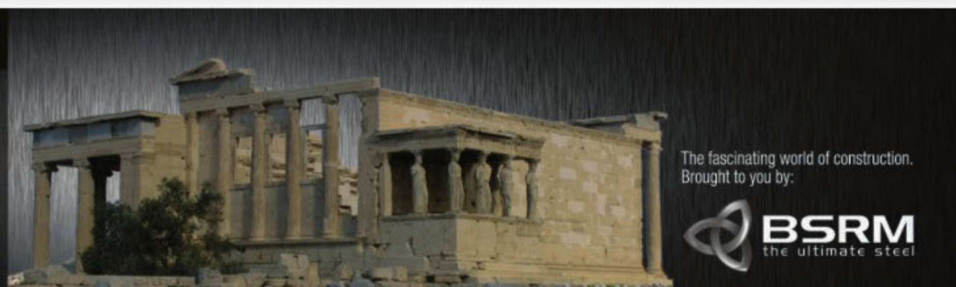
The fascinating world of construction. Brought to you by: BSRM the ultimate steel

The Acropolis of Athens is the best known acropolis in the world. The Acropolis is a flat-topped rock that rises 150 m (490 ft) above sea level in the city of Athens, with a surface area of about 3 hectares.