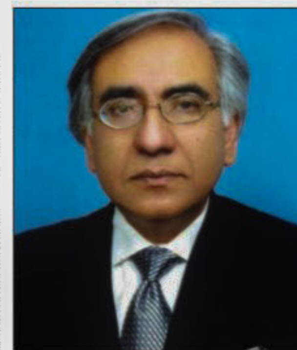
Ashraf Qureshi High Commissioner of Pakistan to Bangladesh