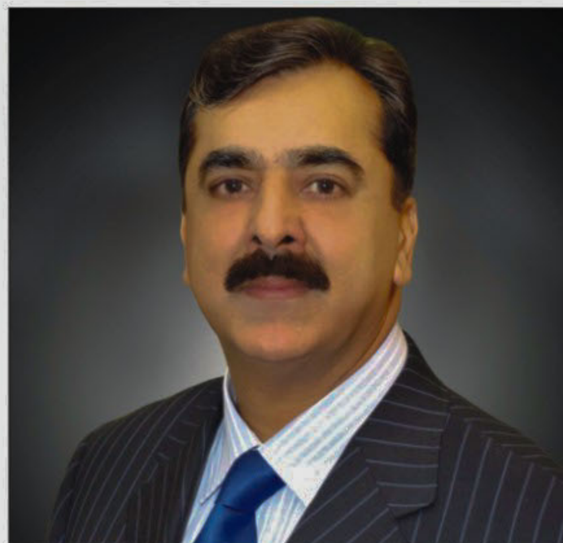
Yusuf Raza Gilani Prime Minister of the Islamic Republic of Pakistan