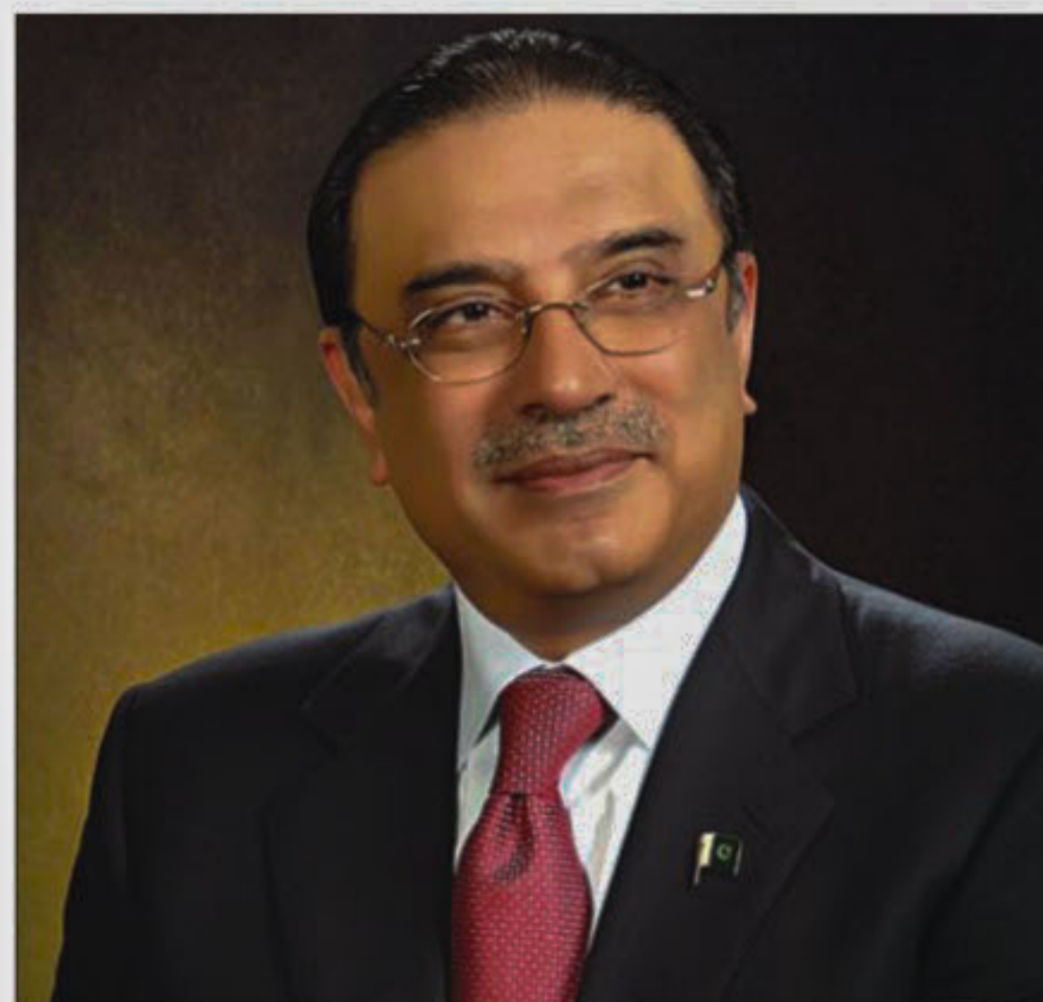
Asif Ali Zardari President of the Islamic Republic of Pakistan