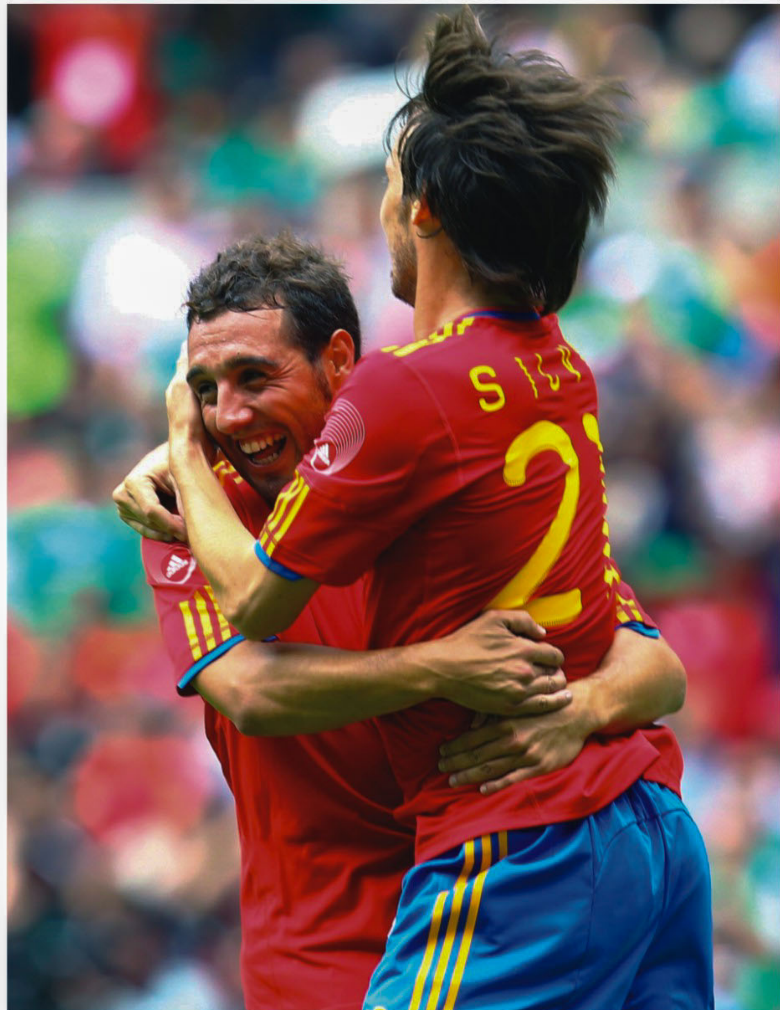
Spanish winger David Silva (R) celebrates his last minute equaliser in their international friendly against Mexico at the Aztec Stadium in Mexico City on Wednesday. The defending world champions escaped with a draw.