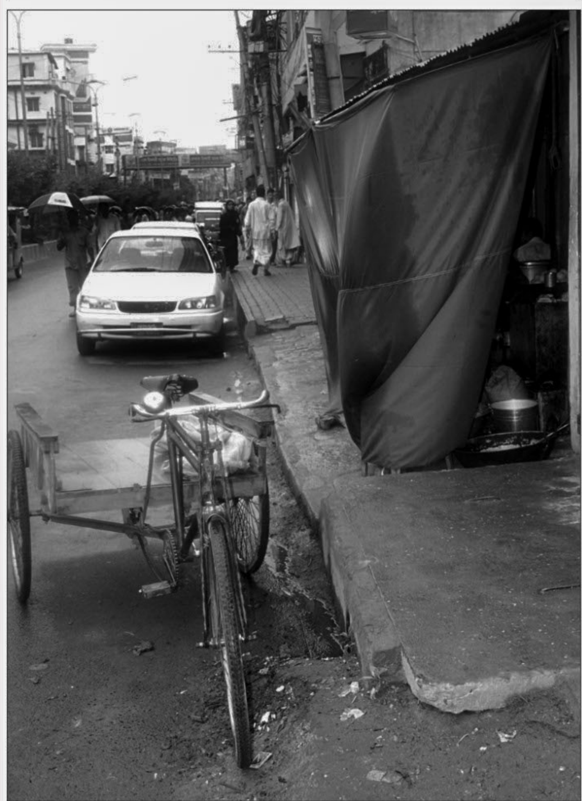
Although the law enforcers have launched a drive to keep sidewalks in Bogra town free to reduce traffic jam, vendors and litter sellers put up makeshift shops thereupon. Photo shows a makeshift litter shop on the footpath near UCB Bank in Borogola area of the town.