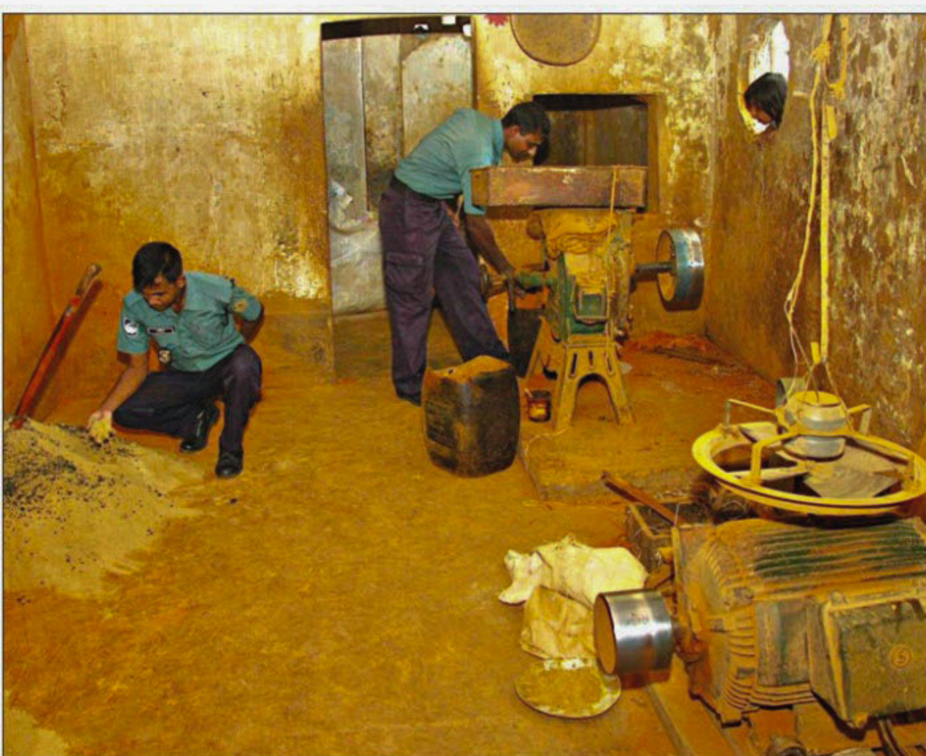
Police go through a spice-grinding mill where fifty mounds of substandard and adulterated spices were seized at Miankhan Nagar under Bakolia police station in Chittagong yesterday.