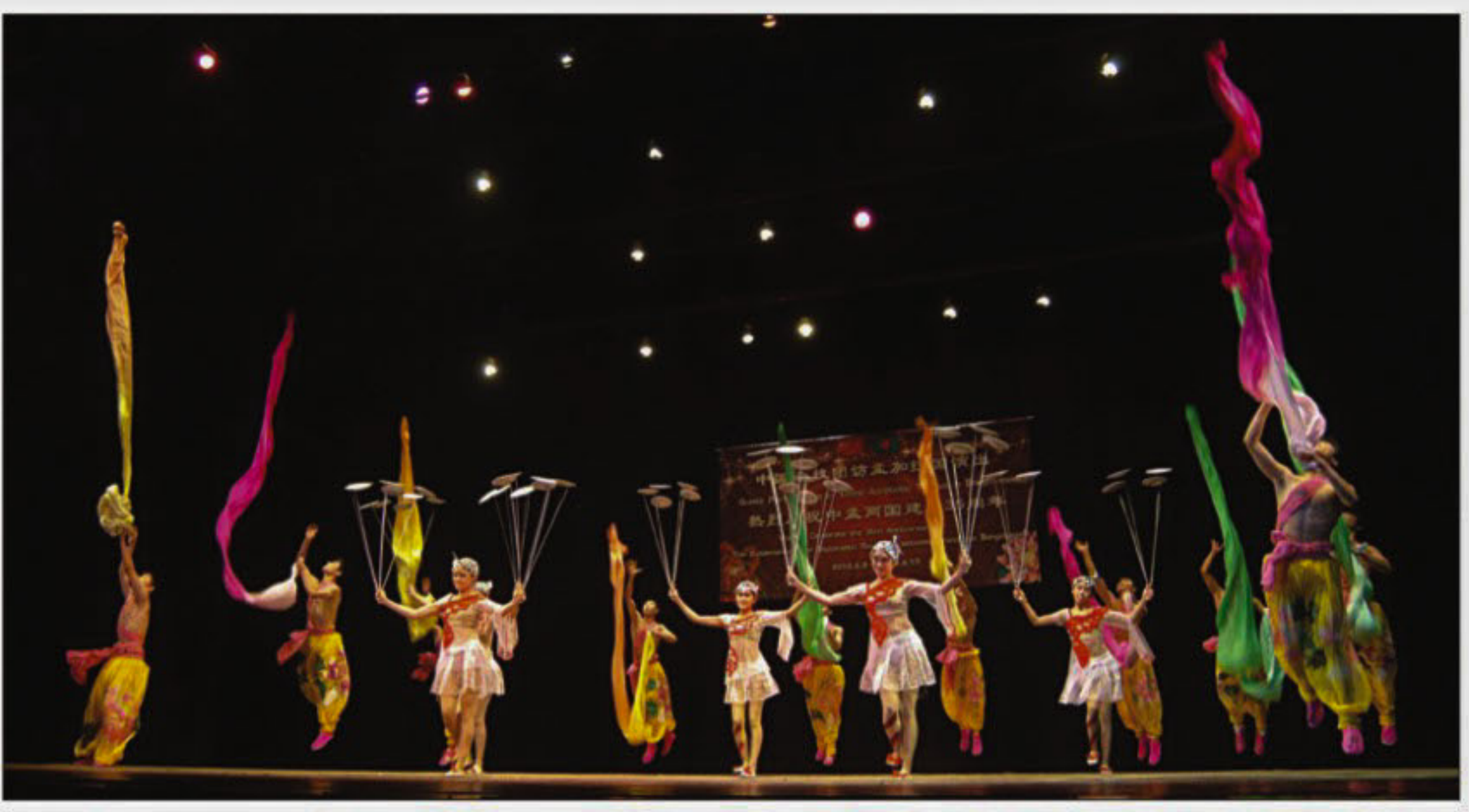
The Chinese acrobatic troupe, consisting mostly of teenagers, enthralled the full-house audience during its hour-long performance.