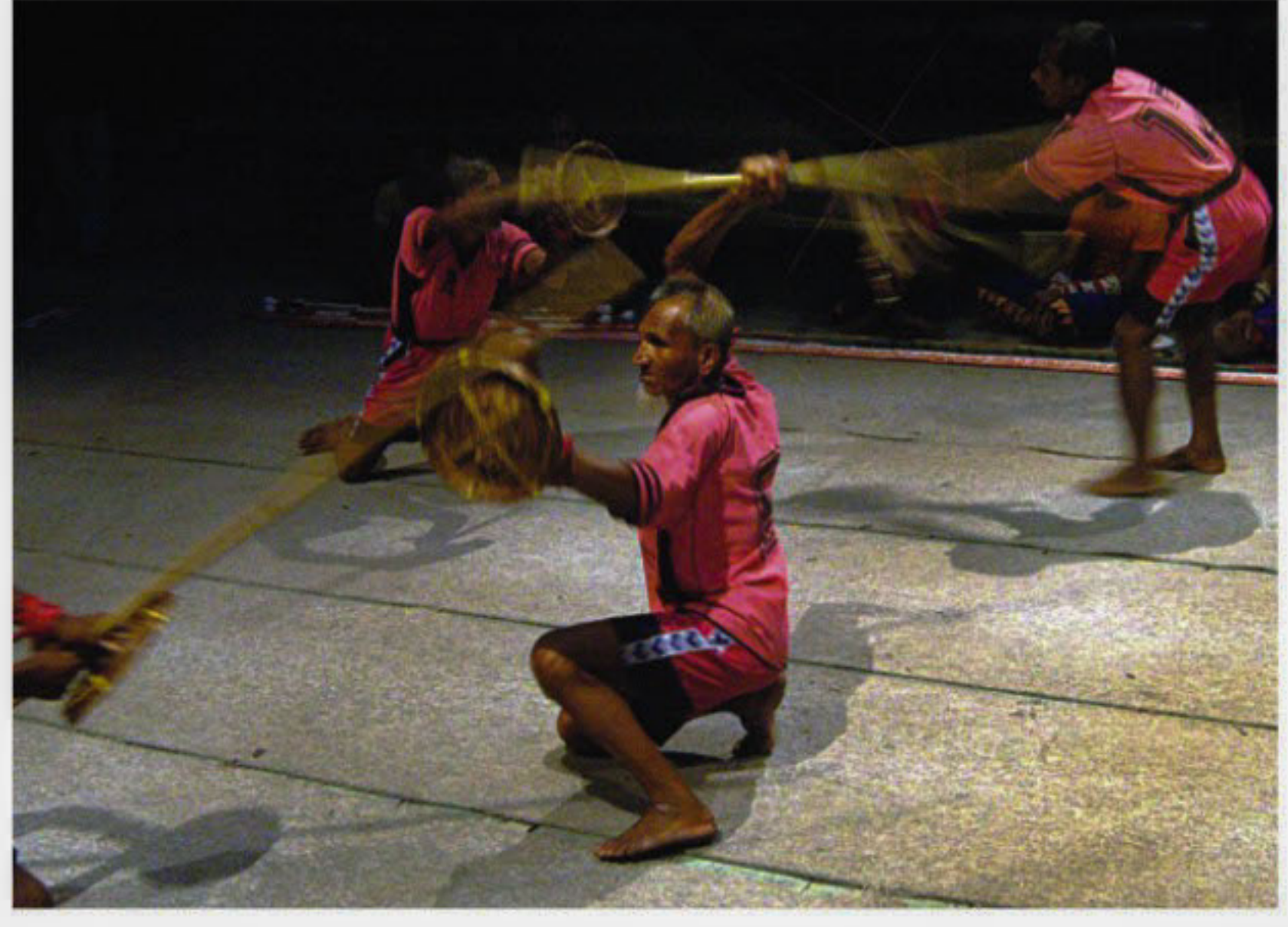
The training session included 14 lathiya from Sirajganj, Netrakona, Kushtia, Manikganj and Narail.

tioners train their body and analyse various moves. Based on that experimental work was done to include these concepts in the training. Also, an attempt was made to come up with consolidated rules and regulations for combat within lathi khela to enable