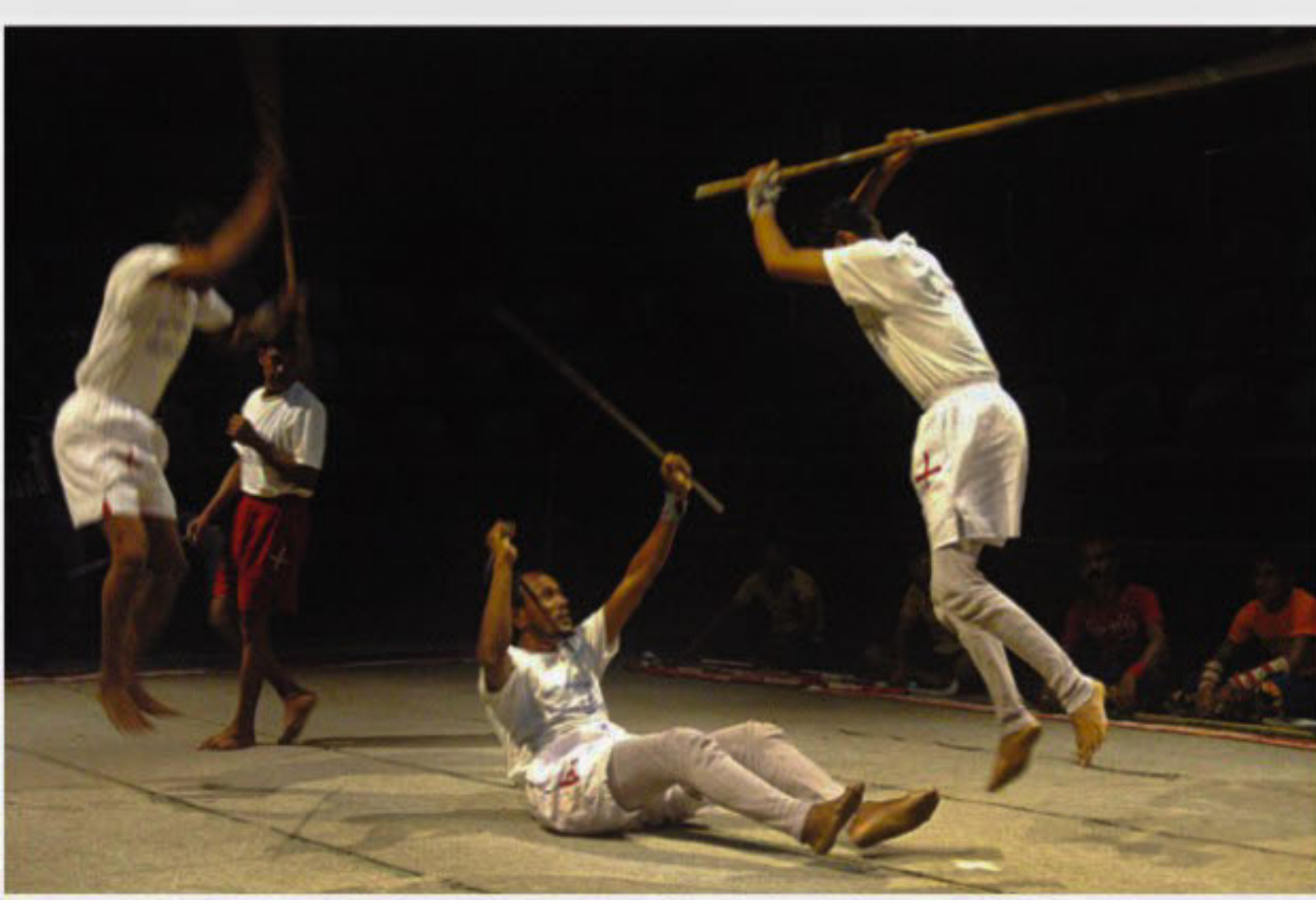
The training session included 14 lathiya from Sirajganj, Netrakona, Kushtia, Manikganj and Narail.