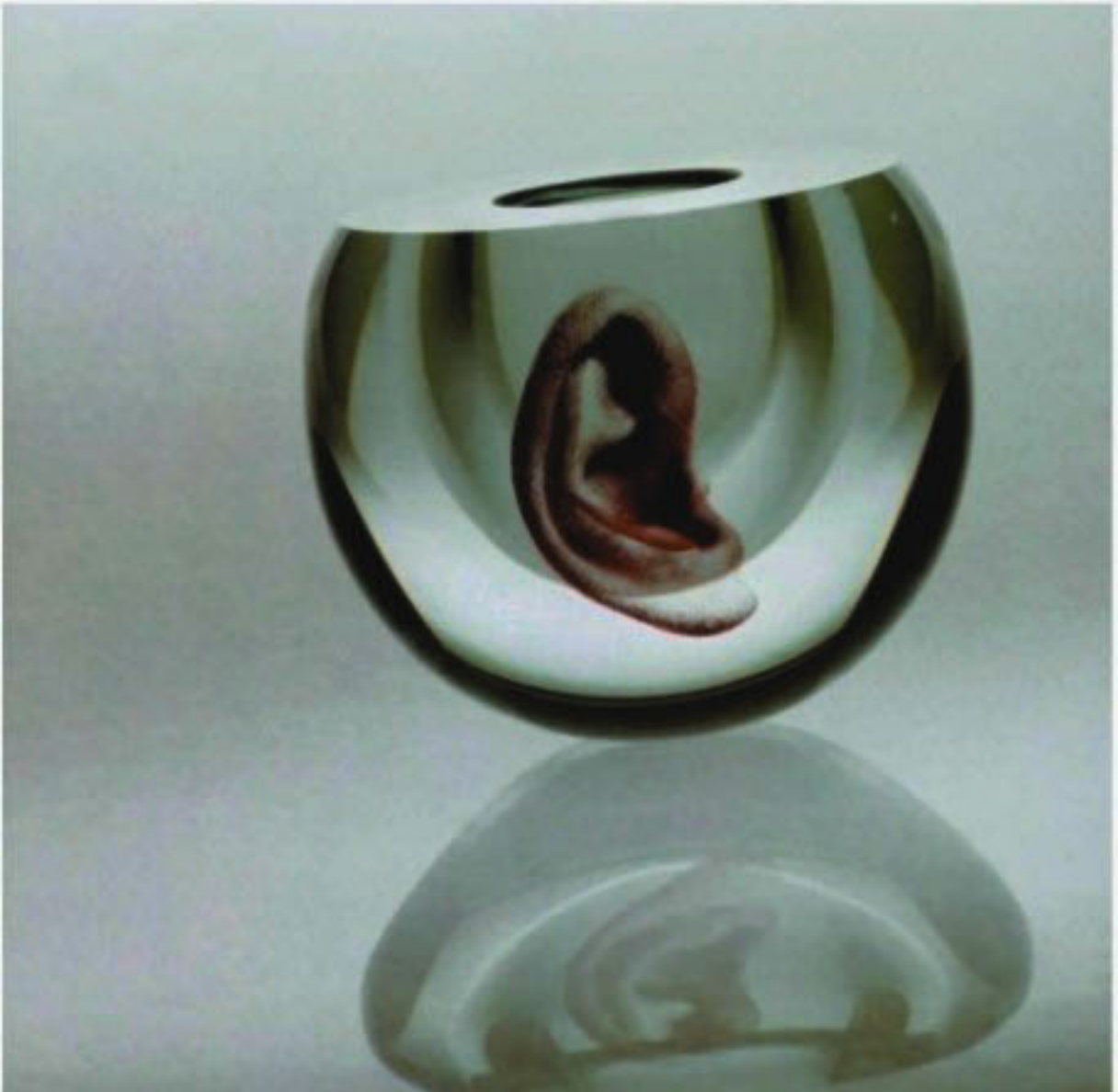
Artwork by Cathrine Maske.

The exhibition continues till August 20.