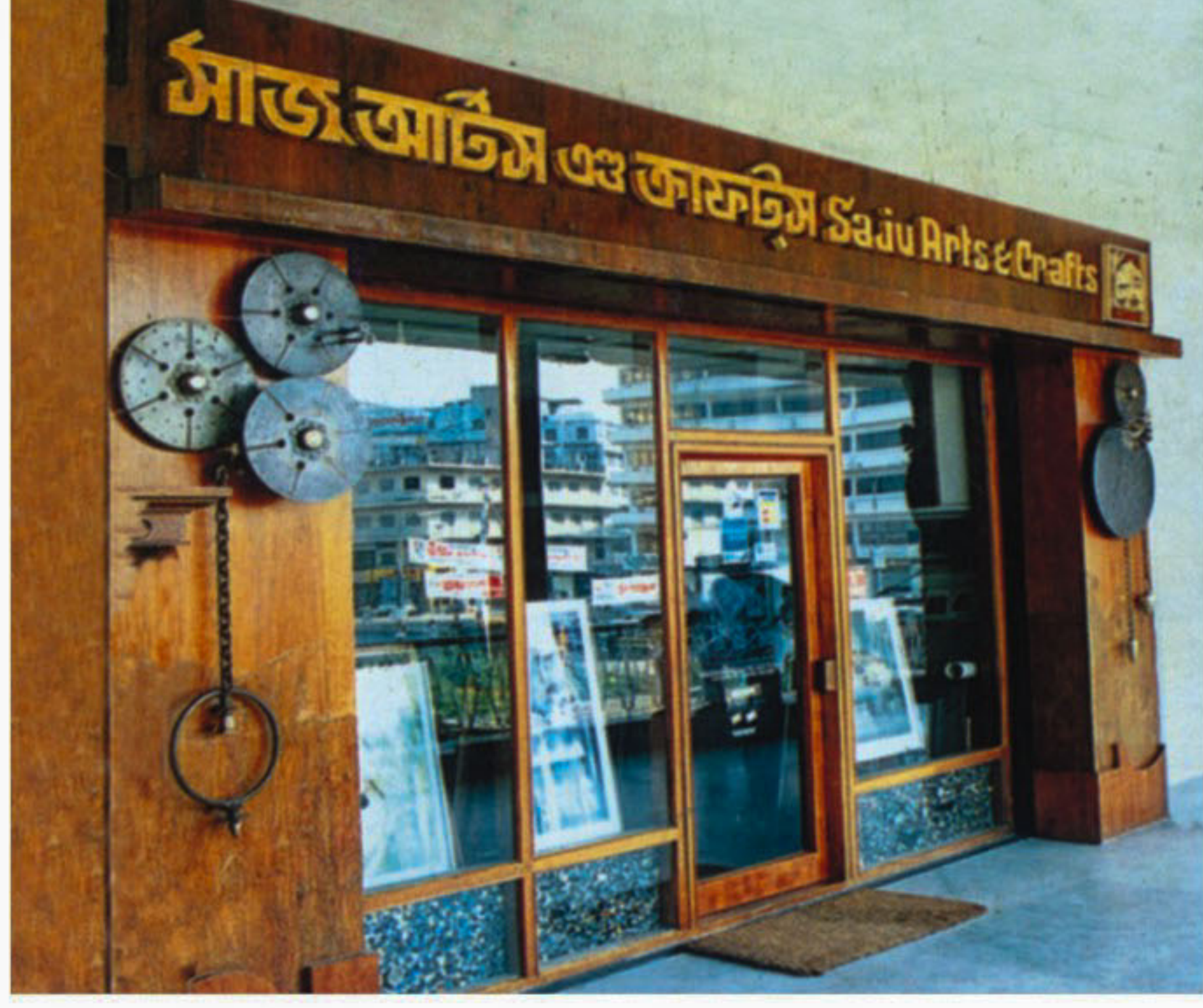
Saju Arts and Crafts at Gulshan DIT Market.