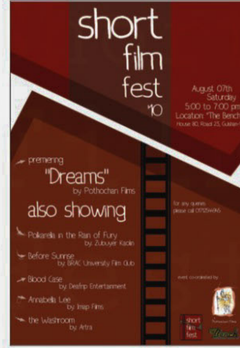
premiere of "Dreams", the main attraction of the festival, by Pothochari