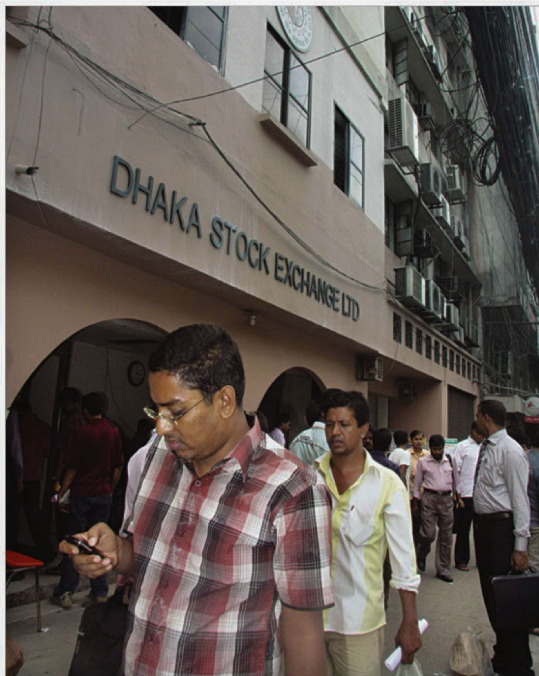
People walk past the building of Dhaka Stock Exchange in Motijheel.

"We are working with a company that wants to float shares equivalent to 25 percent of its paid-up capital and we also requested the regulator to relax the rules. But, neither the company is increasing the IPO size, nor the regulator is relaxing the rules," said an issue manager.