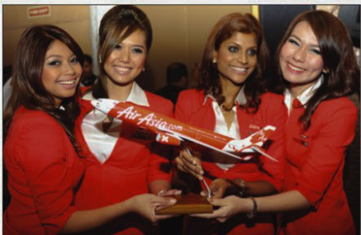
AirAsia airhostesses hold a replica of an AirAsia plane during the launch of the Malaysian low-cost airline's New Delhi-Kuala Lumpur route at the press conference attended by Delhi Chief Minister Sheila Dikshit (R) and Malaysian High Commissioner to India Dato Tan Seng Sung (L) in New Delhi on Thursday. AirAsia will offer first flight fares from as low as one Indian rupee ($0.02), exclusive of taxes.

But Beijing still considers self-ruled Taiwan a part of its territory awaiting reunification, by force if necessary.