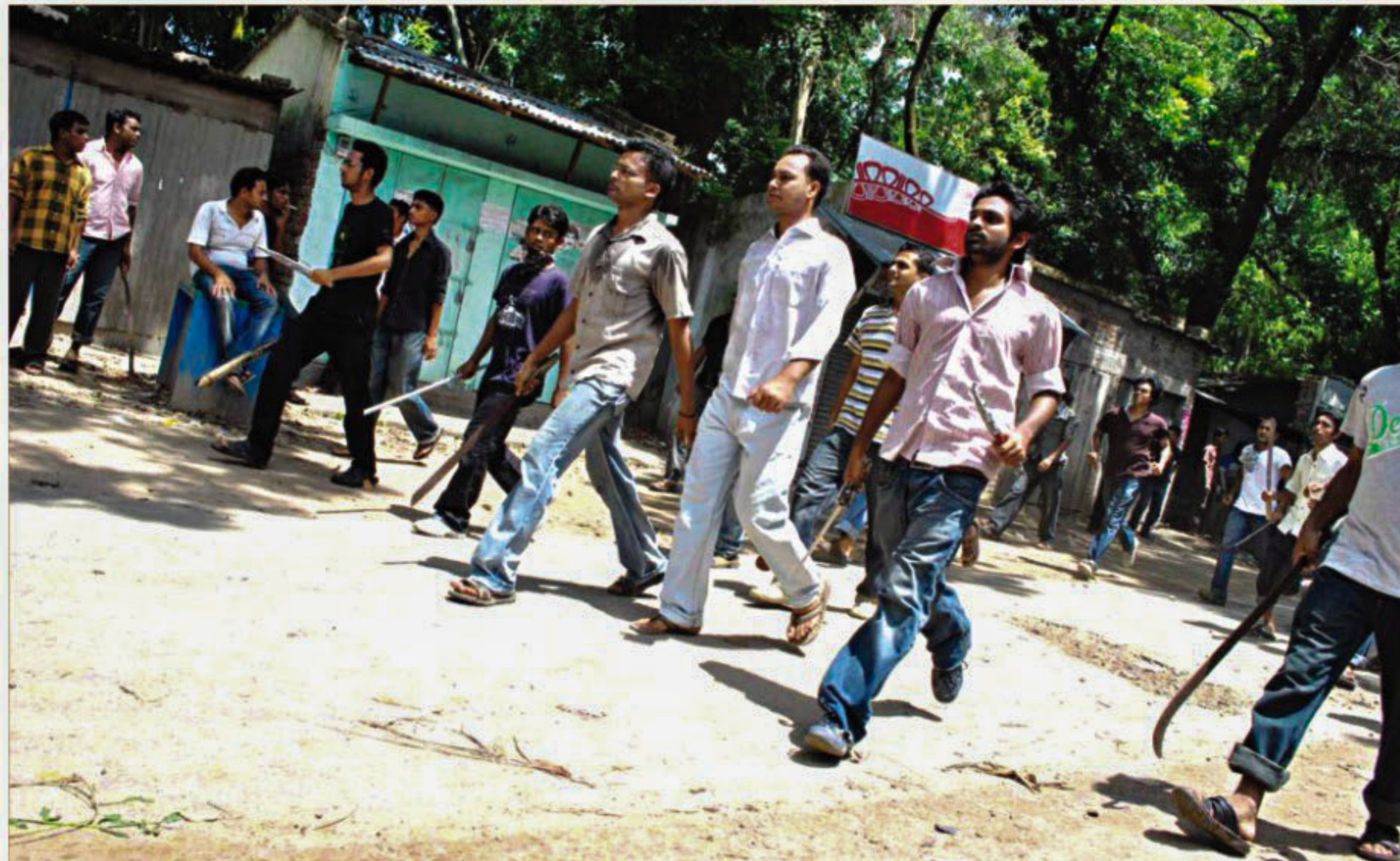
POWER ON SHOW: A photo collage presents, Rajshahi University unit Chhatra League members carrying weapons patrol the campus following a clash with Jubo League yesterday. And, like every campus clash, police presence hardly bothers the activists.