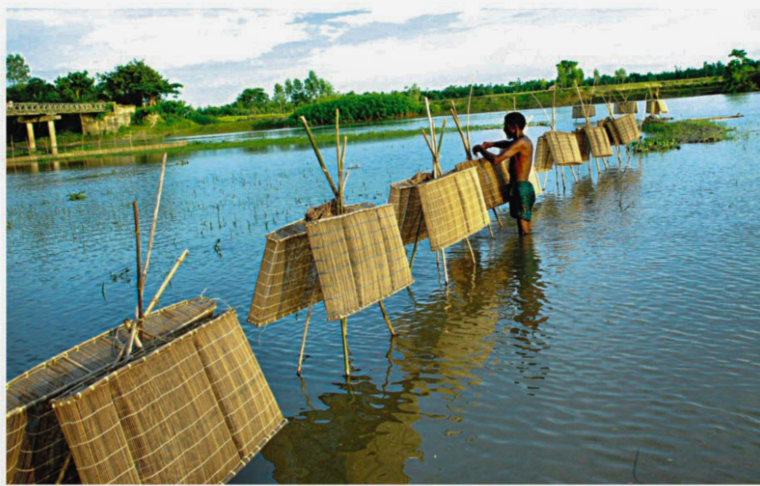
Even though the drought in the north is yet to seize, people of Bogra are enjoying the abundance of water where a fisherman is setting up fish traps at Poradaho Canal in Gabtoli upazila.