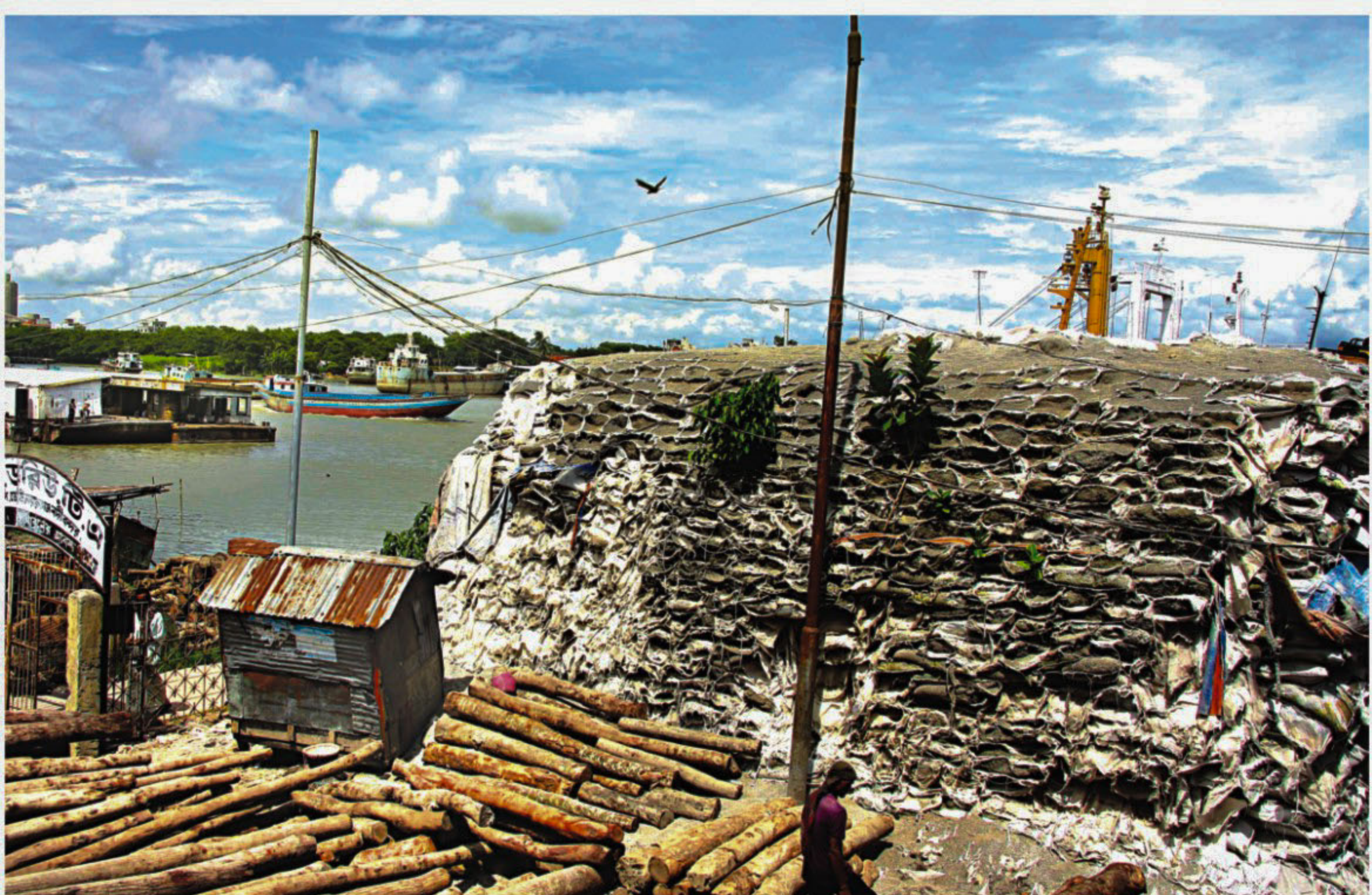
As the BIWTA conducts drives against river pollution and river encroachers, bags of fertiliser are still piled up in the open at its Narayanganj jetty. These bags were imported three years ago. During rain, the fertiliser seeps into the Shitalakkhya.

As per the draft voter list, some 12,762 persons were dropped in Chakoria upazila, 4,154 in Pekua, 12,092 in Sadar, 6,052 in Ramu, 5,955 in Ukhia and 4,851 in Teknaf.