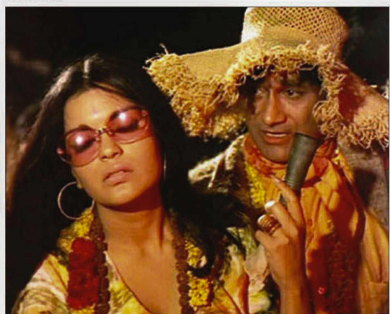
With Zeena Aman (left) in "Hare Rama Hare Krishna".