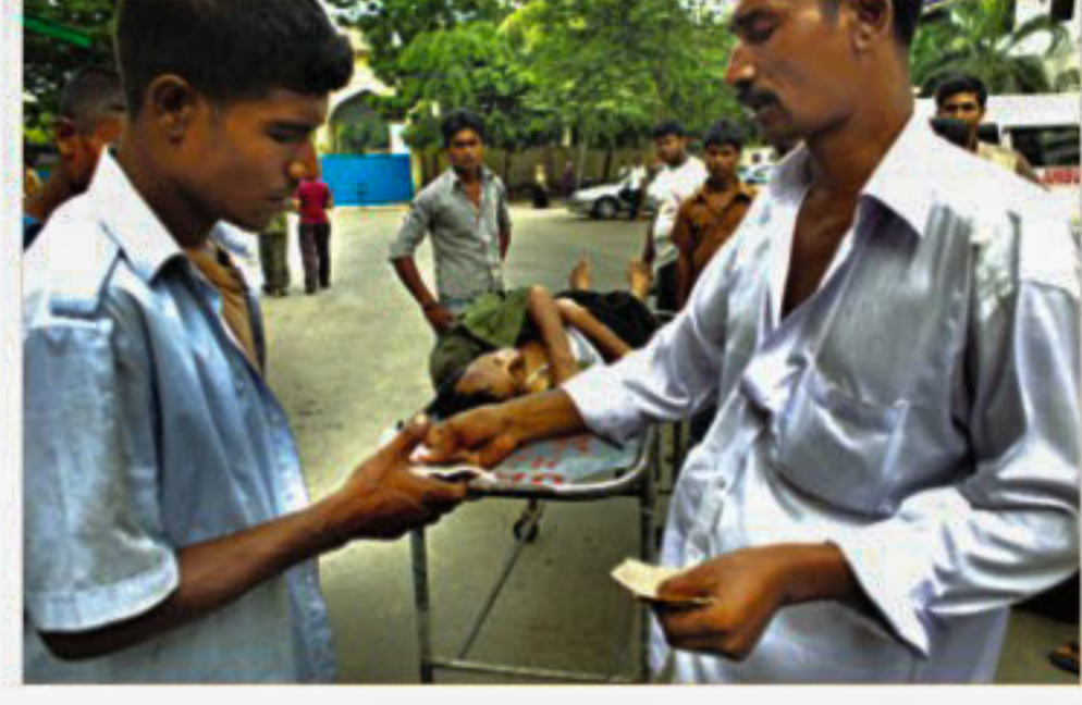
MEDICARE IN A SHAMBLES: A benevolent pedestrian, on the right of the bottom left photo, brings an unconscious man who fell victim to ogyan party at Mirpur at Dhaka Medical College Hospital in a taxi. He had to face a 20-minute-long police enquiry, right, and haggle the fare with an agent of the taxi driver, left photo, at the hospital gate before he could admit the victim to the emergency yesterday. It took the pedestrian 20 more minutes before he could get a doctor to examine the victim, top. This kind of hassle puts off people helping others in distress and raises questions about the emergency care the government provides.