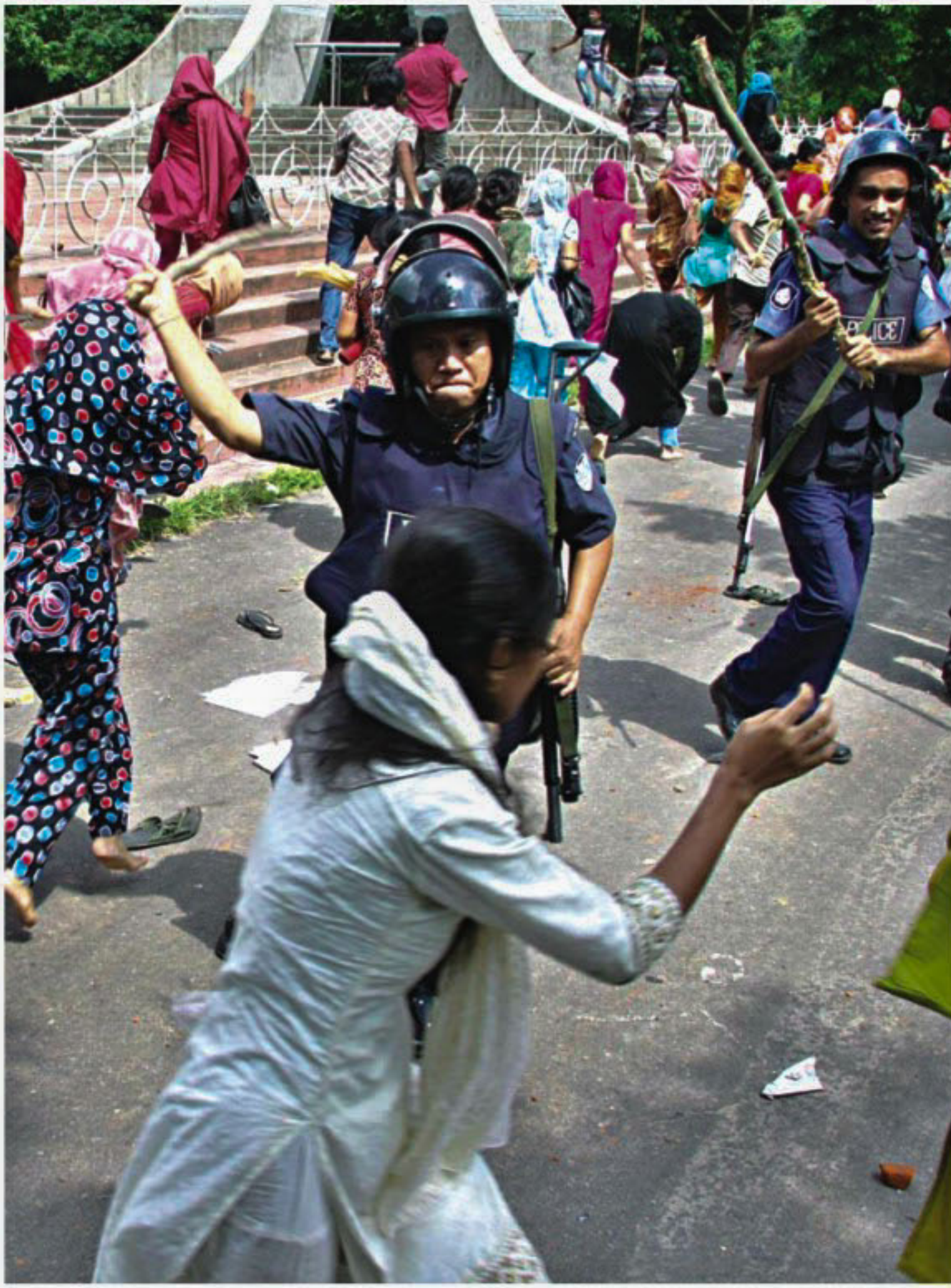
Police baton-charge Chittagong University students demonstrating for the eighth consecutive day to press home their three-point demand including cancellation of fee hike yesterday.