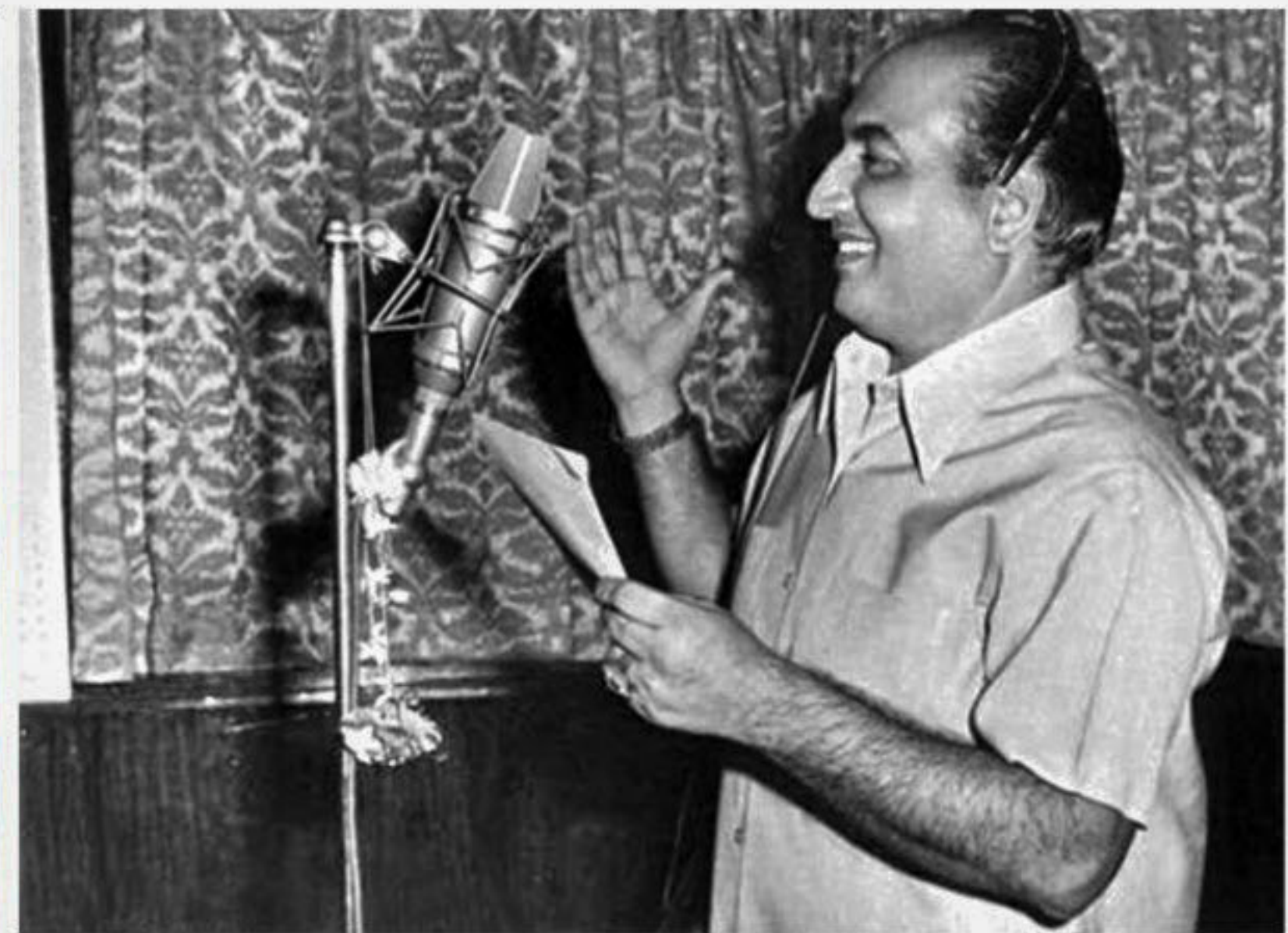
The total package: Shammi Kapoor's (left) face and Mohammad Rafi's voice.