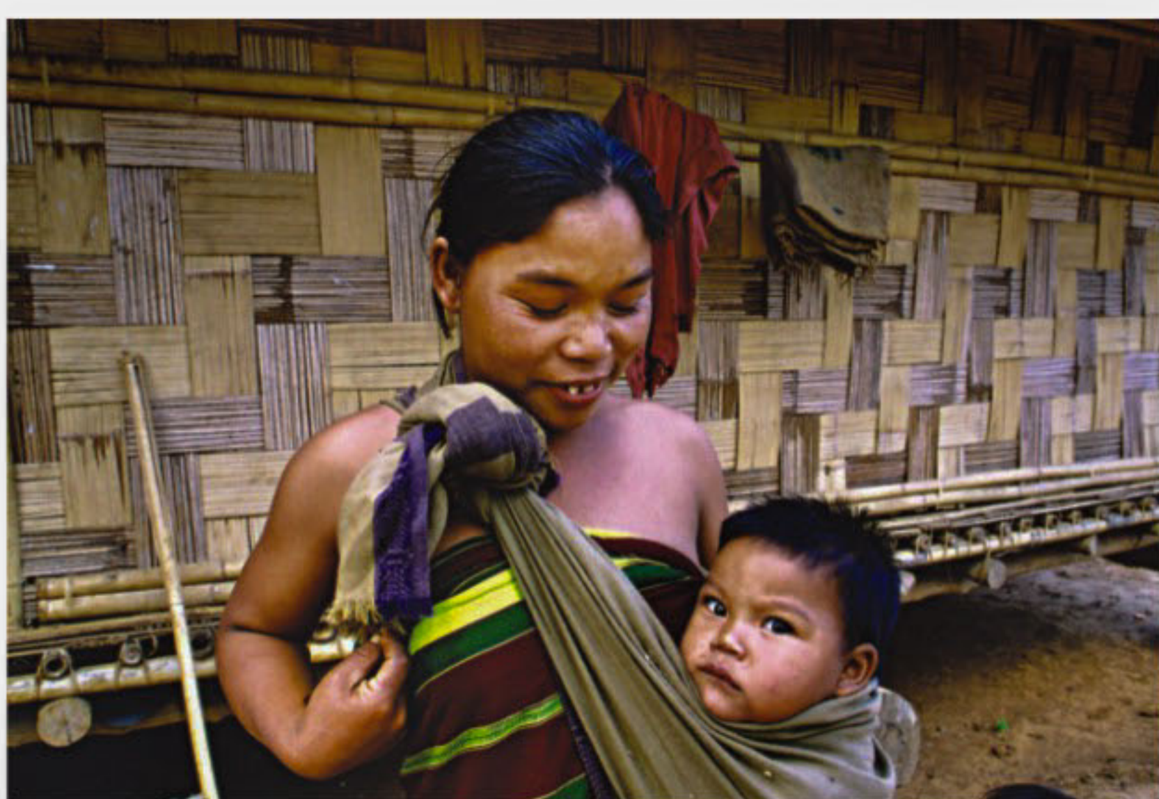
A scene from the film.