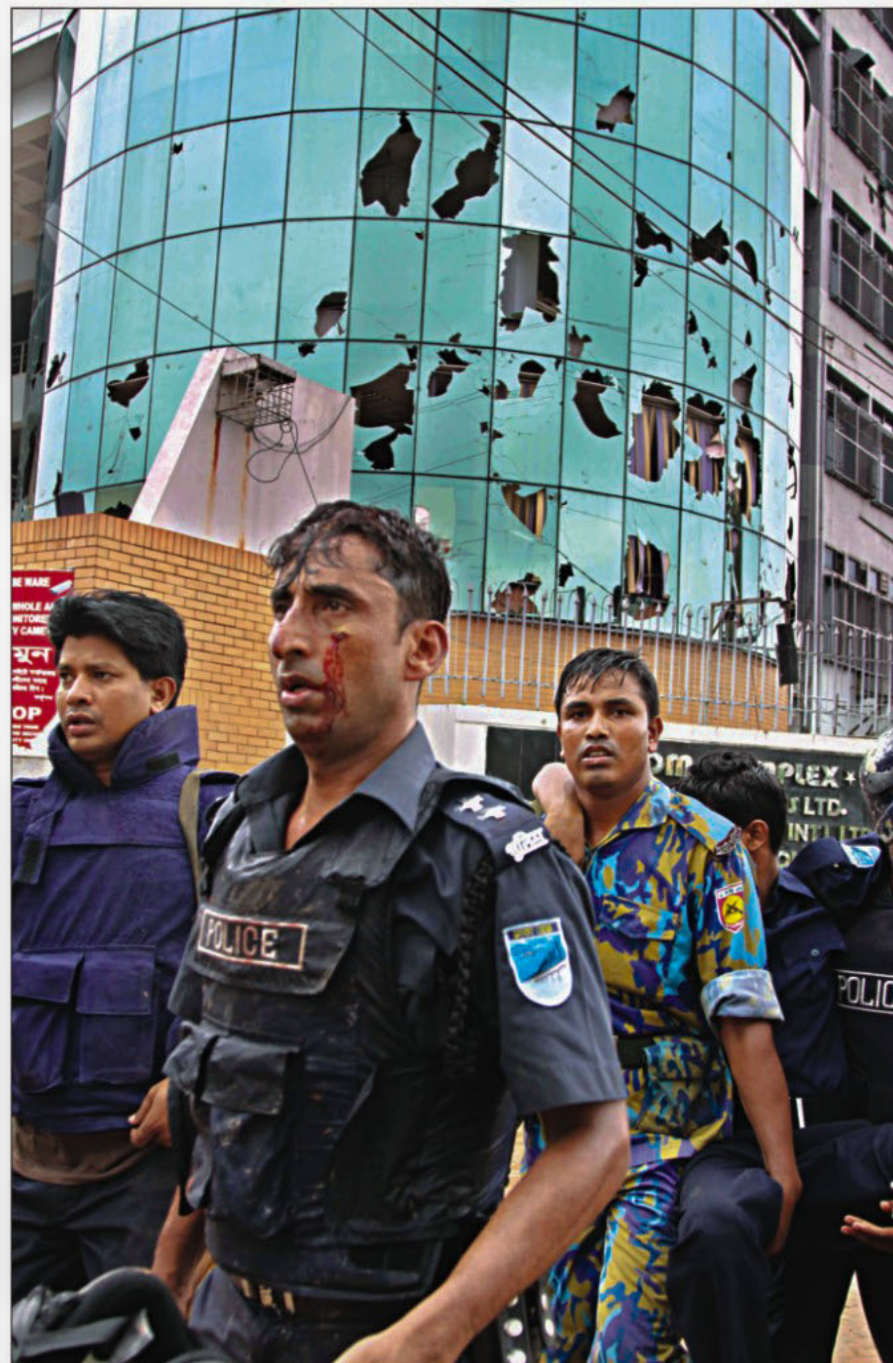
Factories vandalised and injured police personnel looking for medial attention after yesterday's violence at Ashulia centring garment workers' minimum wage.