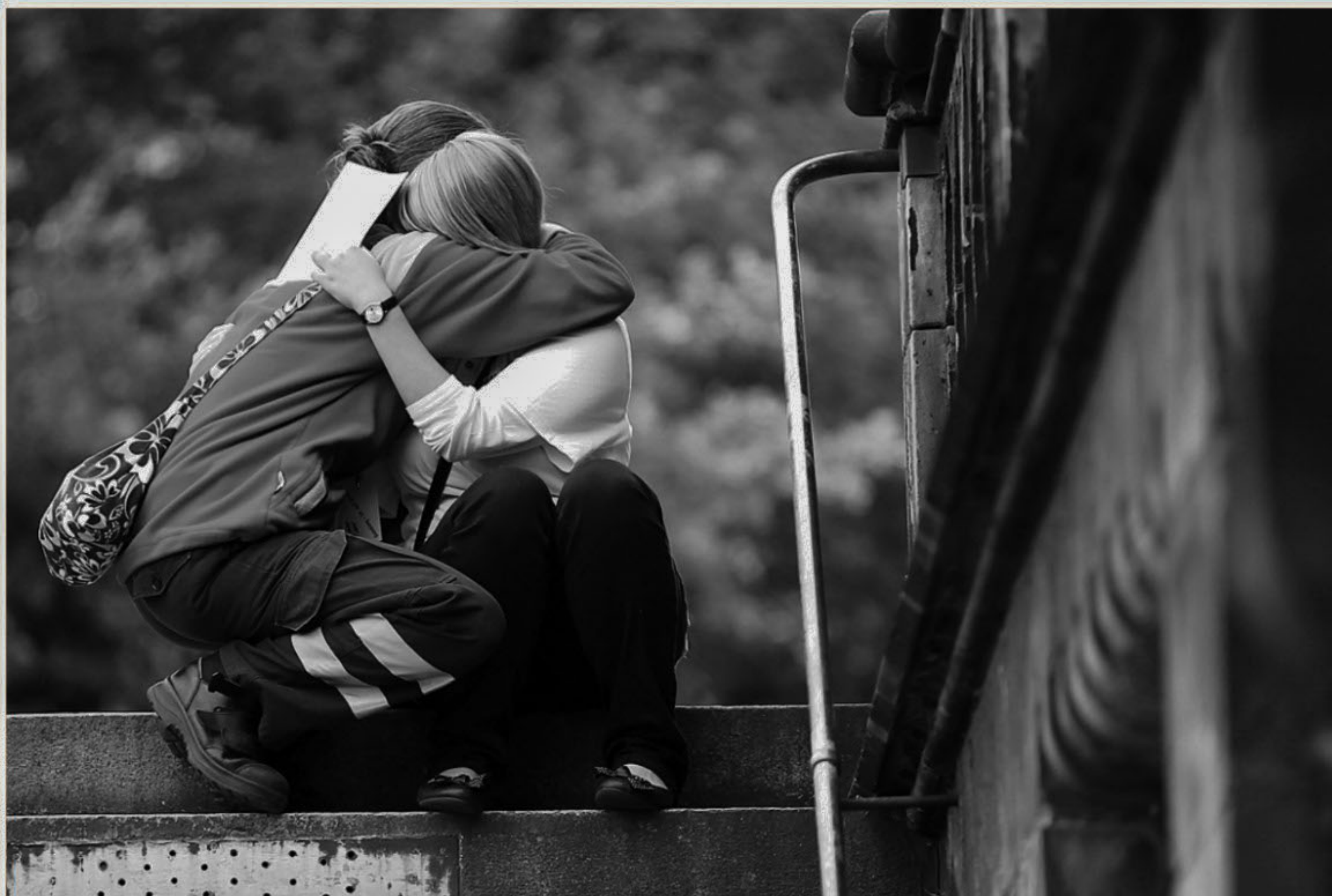
Two women mourn yesterday during a funeral march for Love Parade victims. Thousands of people gathered in Duisburg to pay their respects to 21 people who died in the Love Parade tragedy on July 24. The victims were crushed to death in a stampede as they desperately tried to escape a narrow tunnel that served as the only entrance to the grounds hosting the techno music festival.