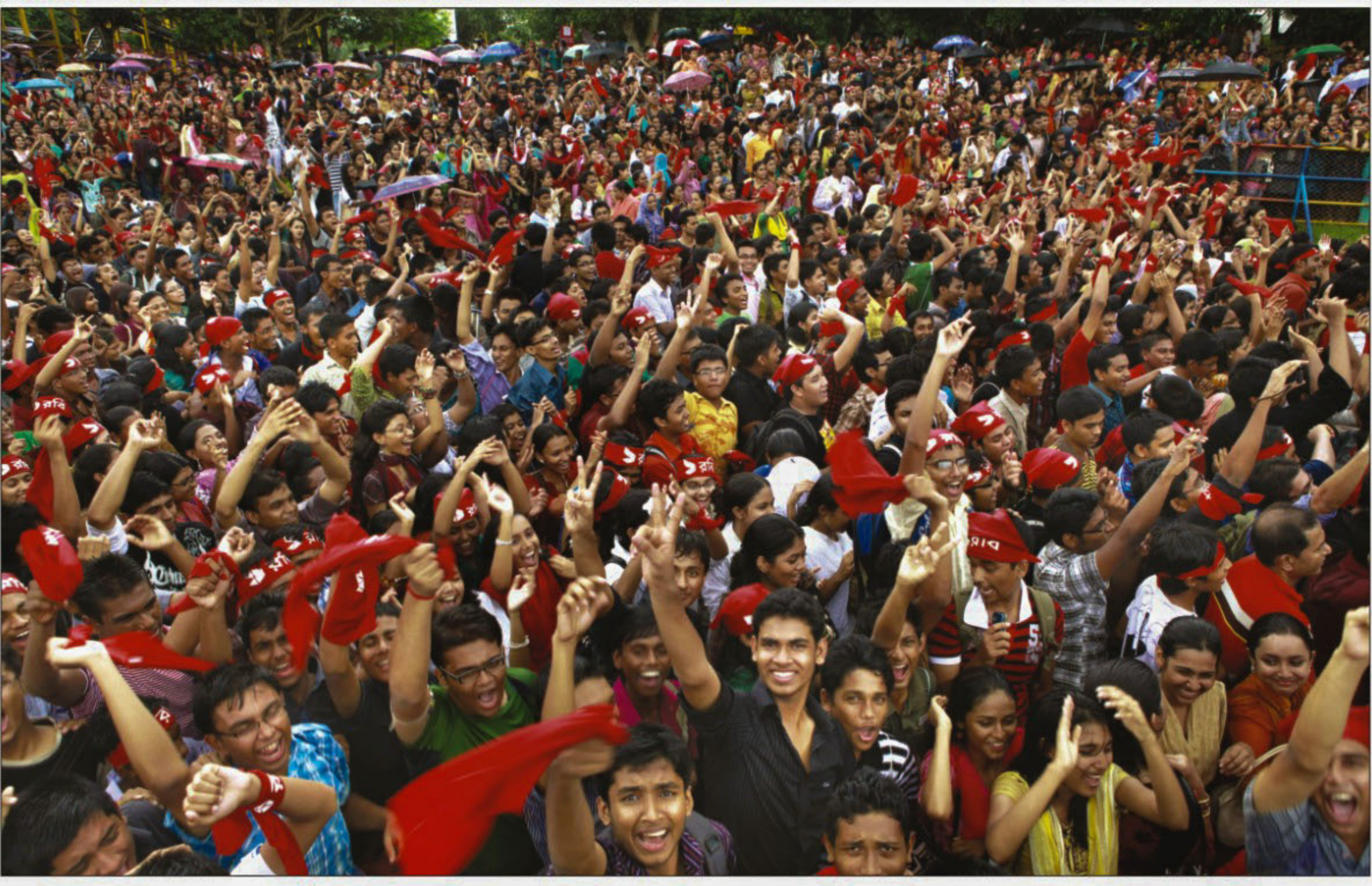
GPA-5 achievers in the HSC examinations celebrate at a reception at Nandan Park in the city yesterday. The Prothom Alo and Robi organised the event.