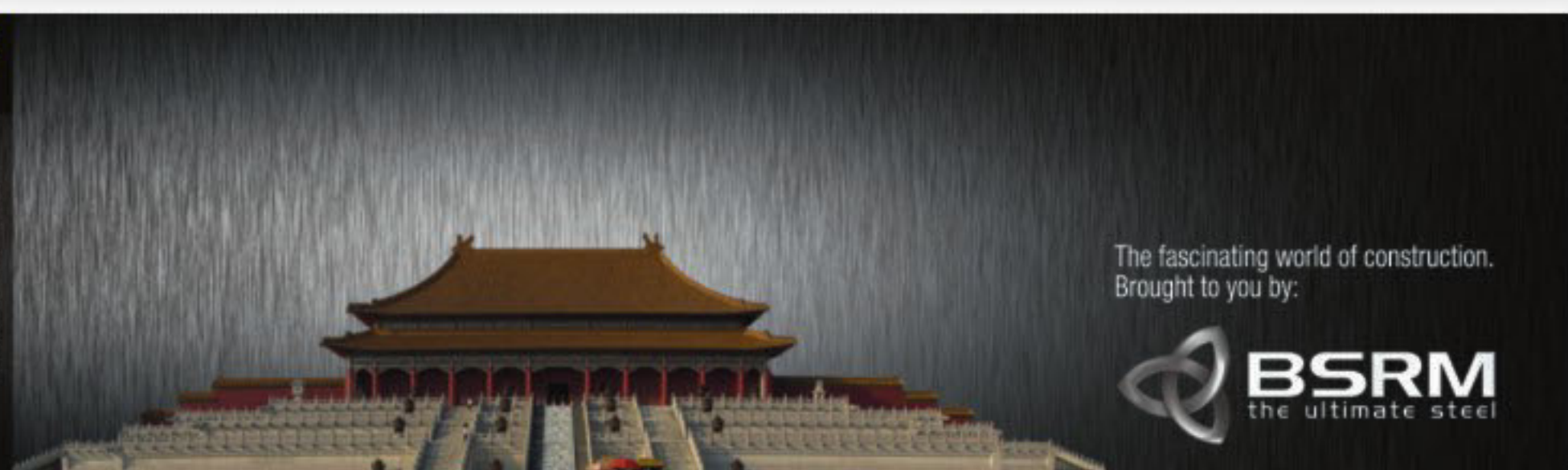
The fascinating world of construction. Brought to you by.

The Forbidden City in Beijing, China is considered as the largest palace in the world, with, as claimed, an astonishing 9999 rooms covering 0.72 million square meters.