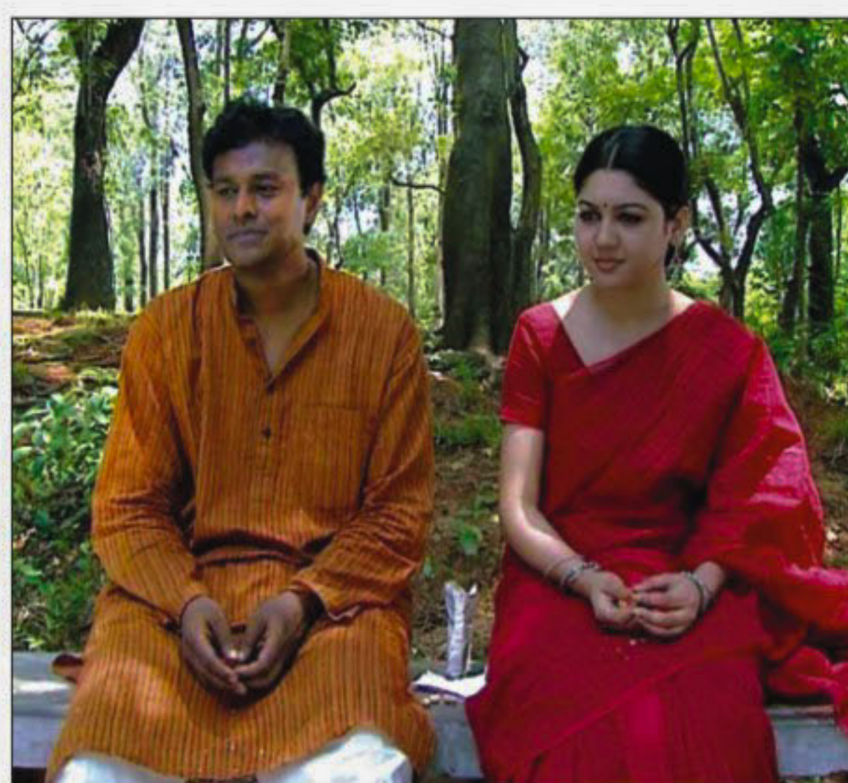
A scene from "Jora Shaliker Galpo".

Live programme from Beauty Boarding on Channel i