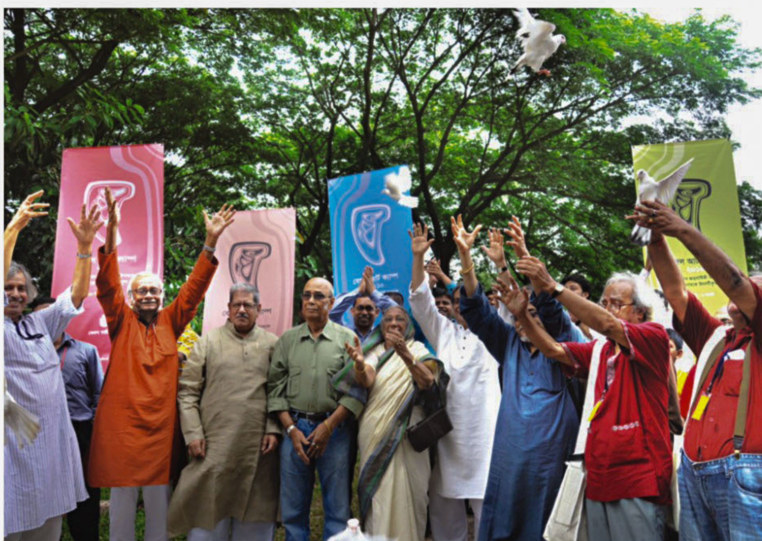
Veteran and promising painters of Bangladesh and India at the inaugural of the art camp.