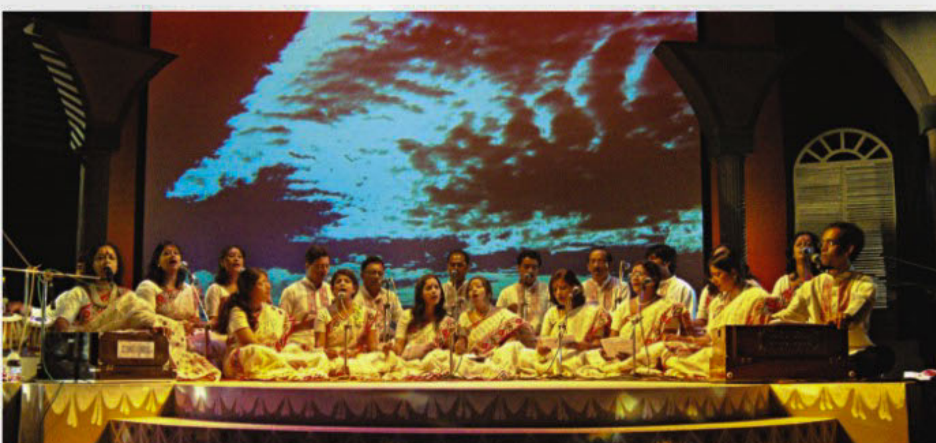
Tagore's emotions in different circumstances were narrated in the programme.

Inauguration of cultural organisation Uttorayon