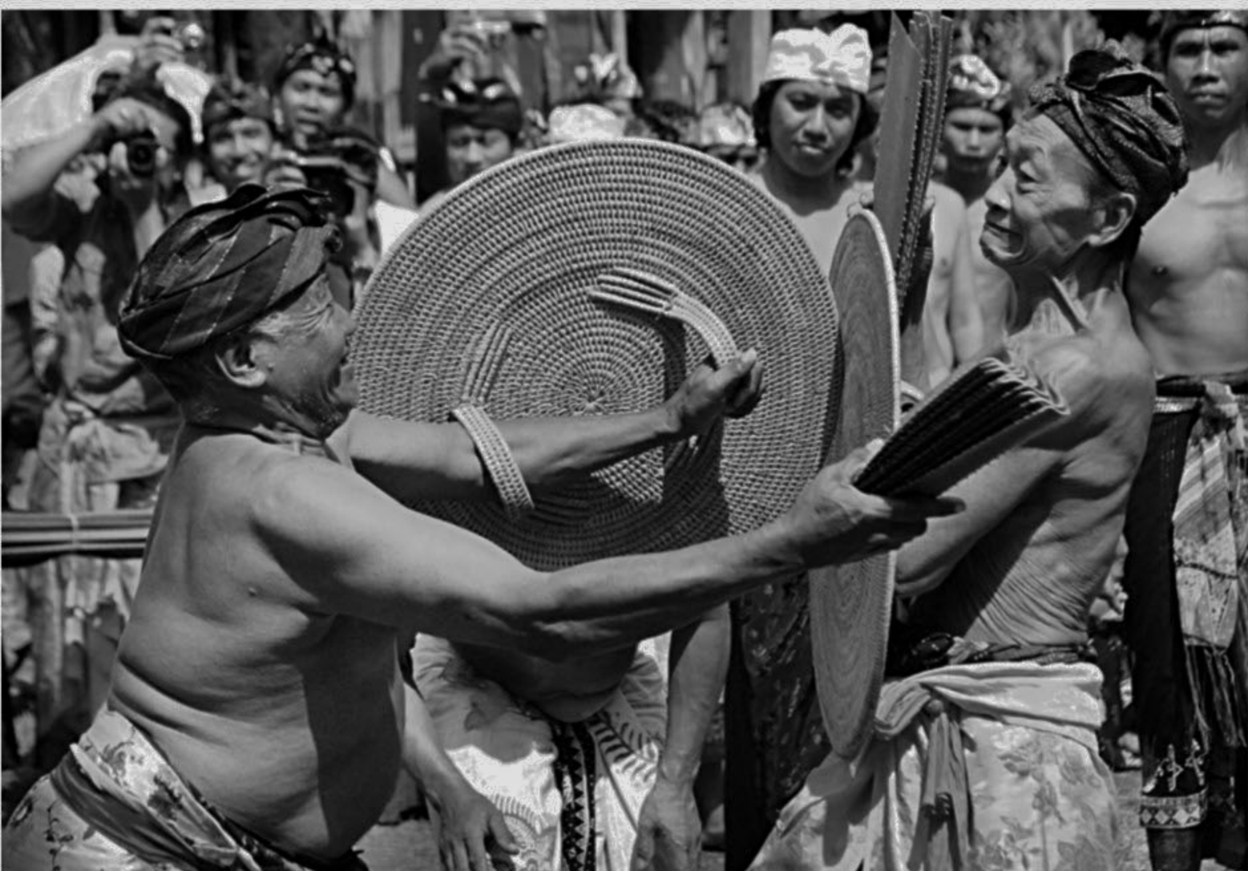
Elderly Indigenous Balinese participate in the ritual pandanus battle in Tenganan village, Karang Asem, Bali yesterday. During the traditional annual Balinese ritual duel men of all ages do battle armed with a rolled pandanus leaf and a rattan shield to honour the Hindu god of war, Indra.