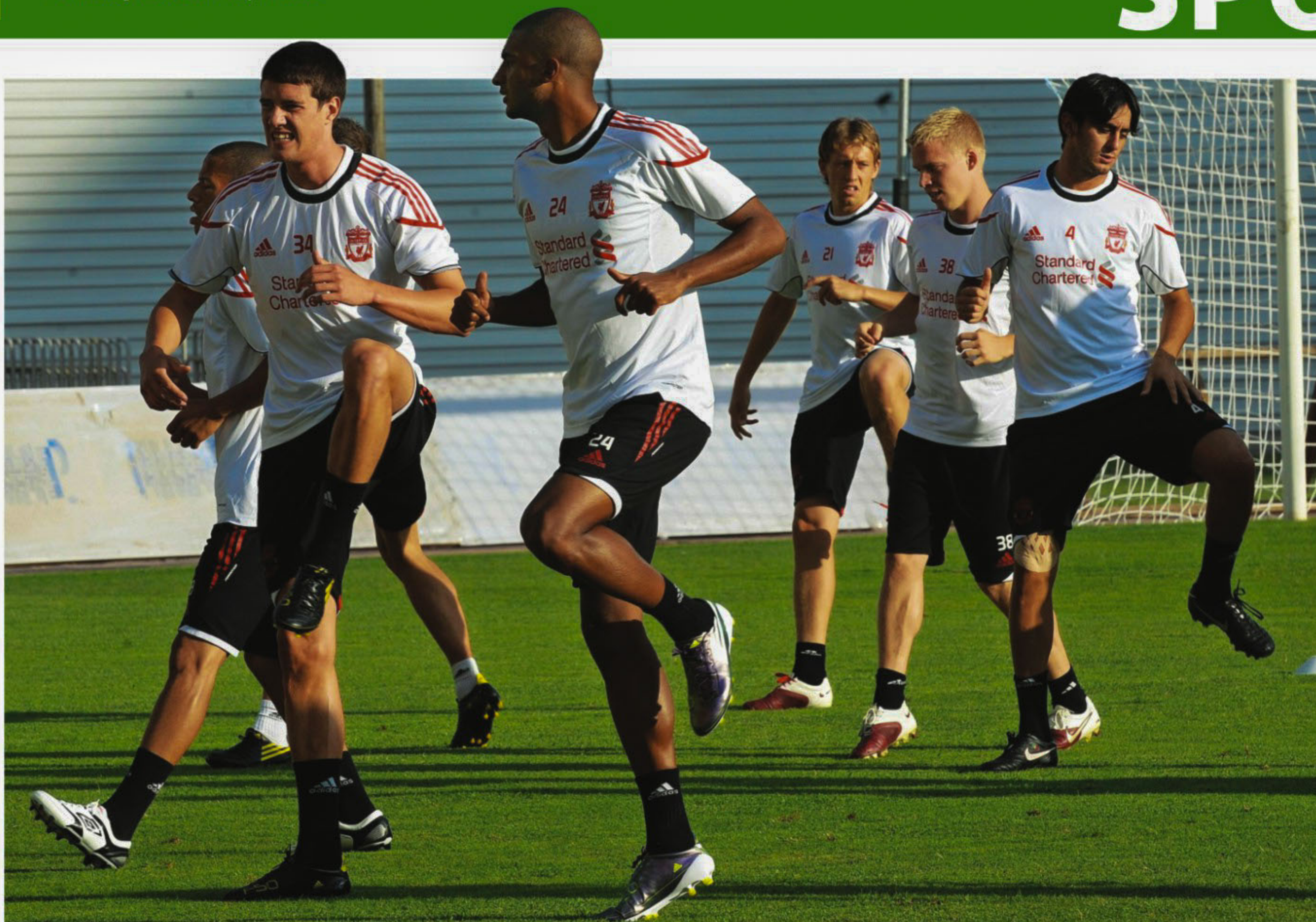
Liverpool players do warm up exercises during a training session at the national arena in Skopje on Wednesday.

He joined the Premier League club as a 16-year-old in 2003 and has made a total of 267 appearances scoring 48 goals.