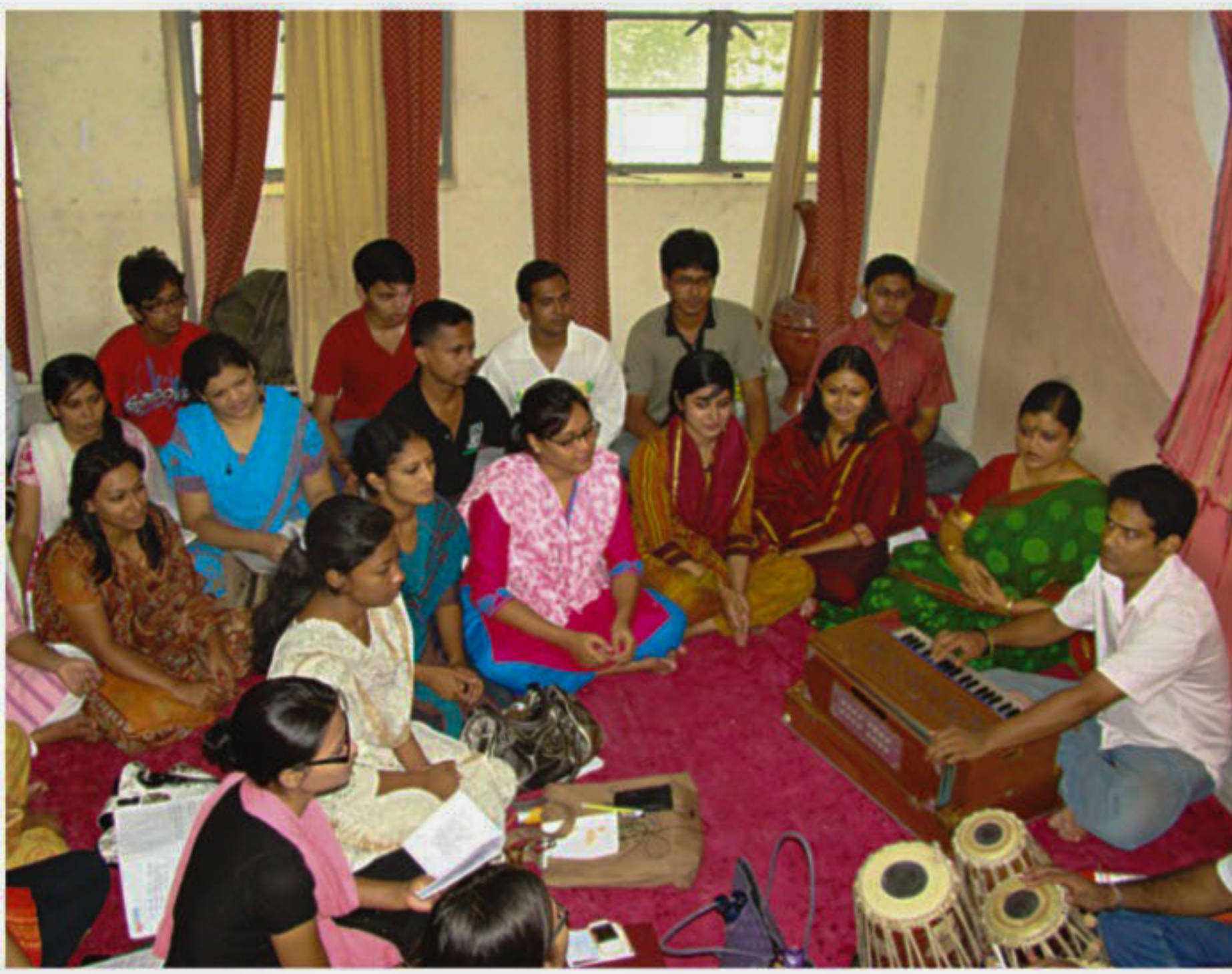
Students of Music Department, DU, during a rehearsal for the festival.