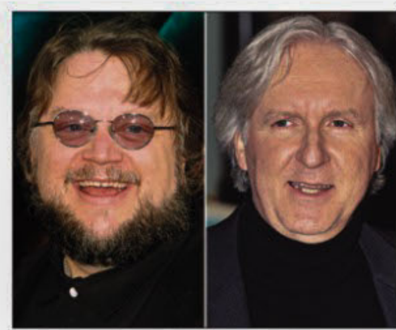
Guillermo del Toro and James Cameron.

The film allegedly will be shot in 3-D and pre-production will begin in the