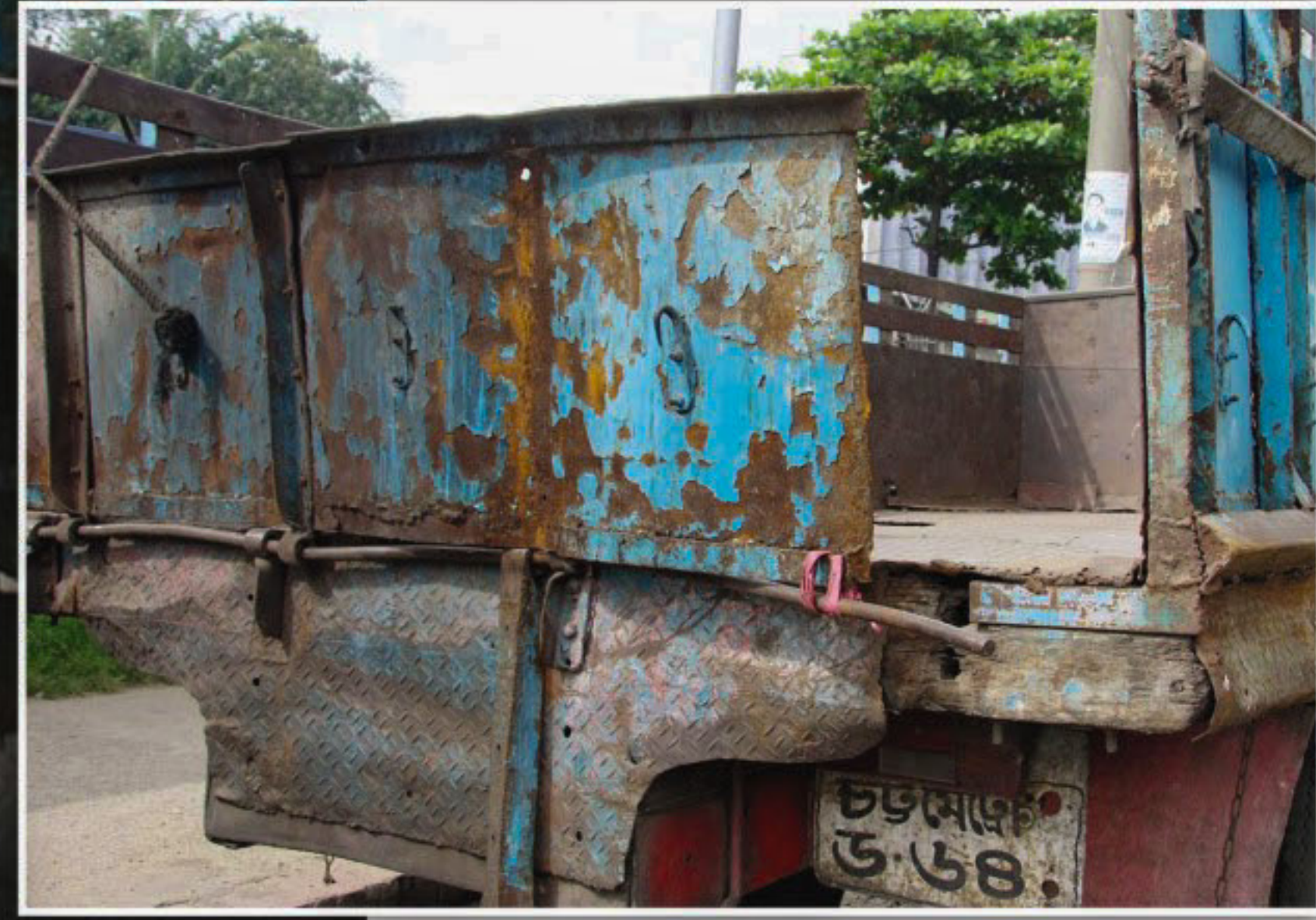
Worn-out trucks ply the roads in the port city of Chittagong posing risk of accidents and causing gridlock as well as air pollution. Drives against the vehicles plying the roads without legal documents and paying government fees are going on with the help of traffic department of police.