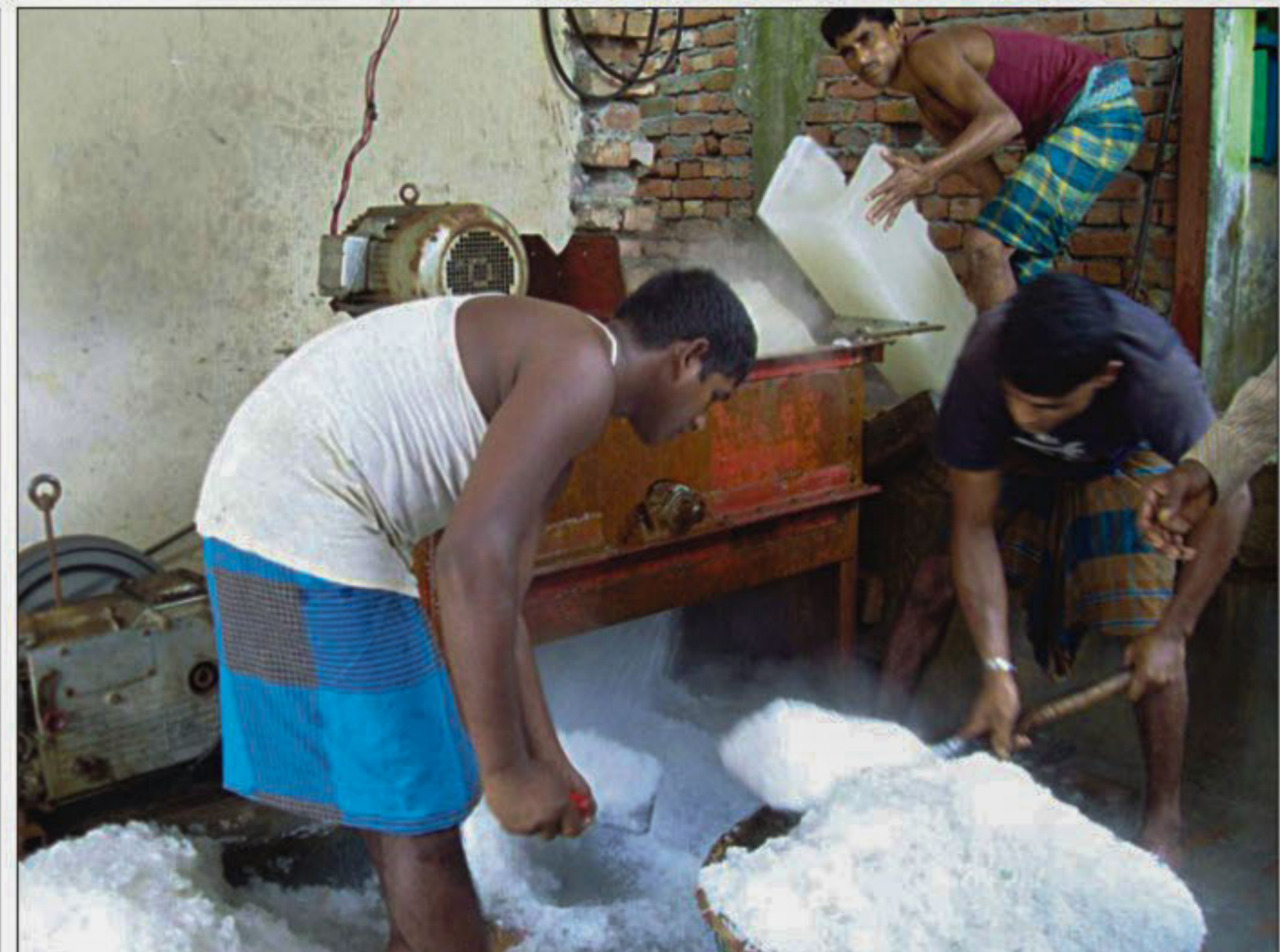
Workers process ice at a factory at Mohipur near Kuakata sea beach as the item, used for preserving fish, is of great demand during the ongoing hilsa catching season. Frequent power cuts, however, hamper ice production, causing serious problem to fishermen and traders.

Relatives said the children went to take a bath in a pond near their house on Tuesday but they drowned as they did not know how to swim.