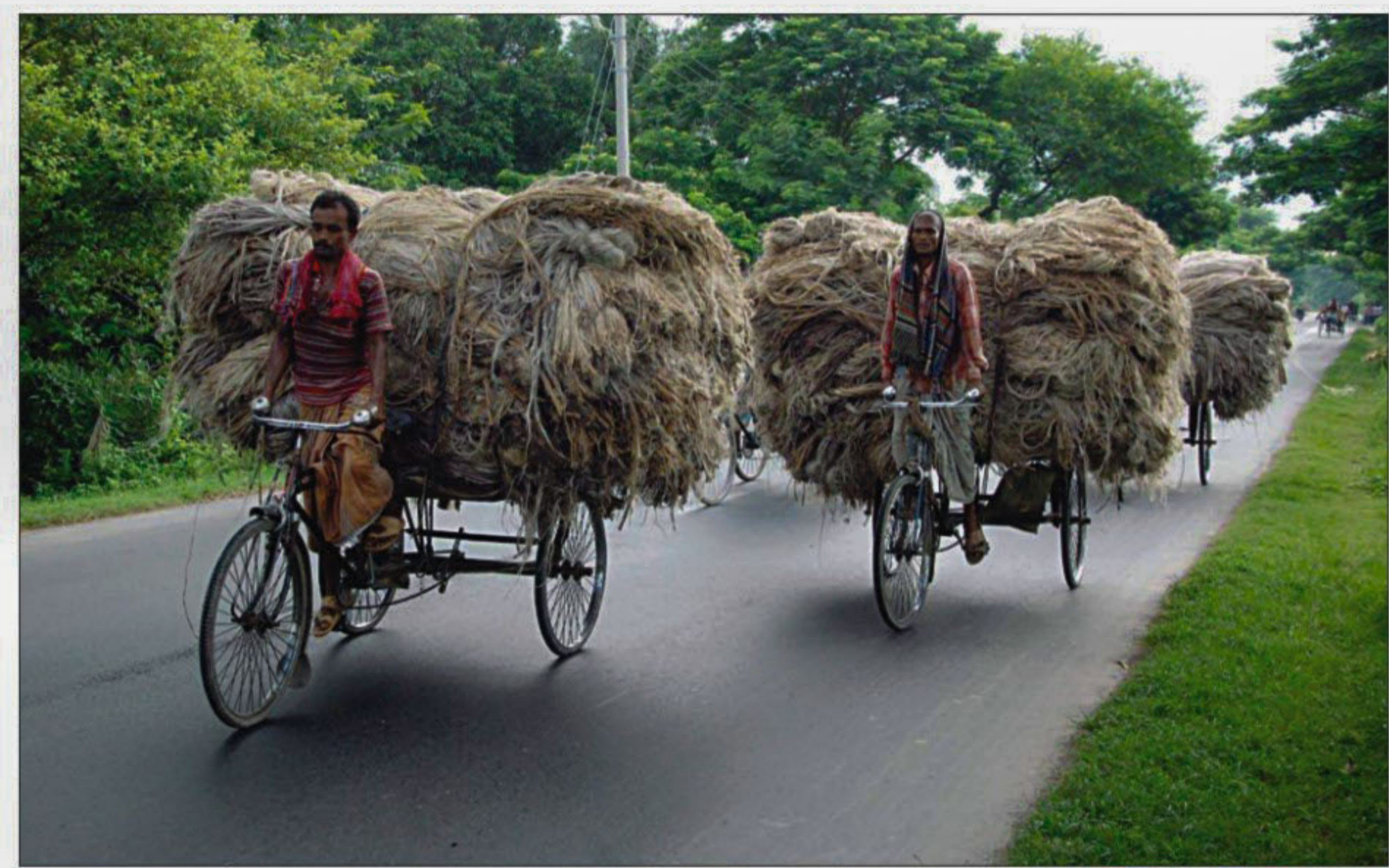
Bundles of jute fibre are being taken to local market for sale in Baleshwar area of Rajshahi district yesterday. High yield and high price of the cash crop this season make the farmers of this district happy.

When contacted, an engineer of WZPDCO said, "We need 24 to 26 MW power in Patuakhali daily but only 11 to 12 MW is being supplied from the national grid."