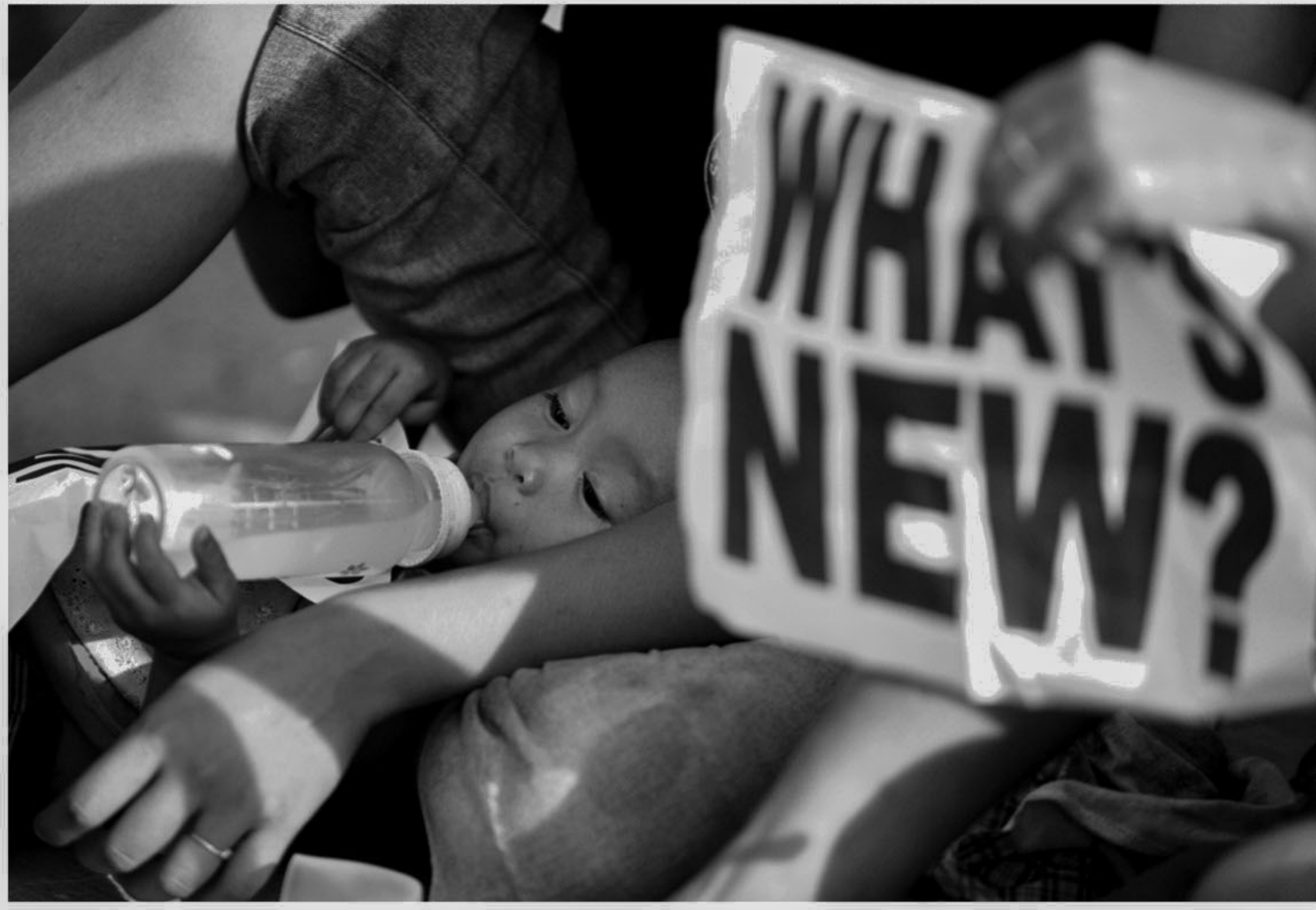
A protester holds a banner with words reading "What's New" as he listens to the first State of the Nation address of Philippine President Benigno Aquino at the House of Representatives in Manila yesterday. Thousand of protesters marched to demand the new government headed by President Benigno Aquino to prosecute former Philippine president Gloria Macapagal Arroyo and to act to stop extra judicial killings.

Its 9,000 mile (15,000 km) voyage aimed to raise awareness of the dangers posed to the environment by plastic waste.