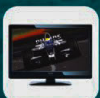
32" LCD TV